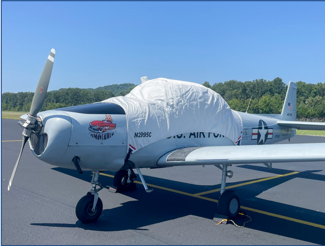
Navion L-17B Canopy Cover (With Avionics Bay Extension)