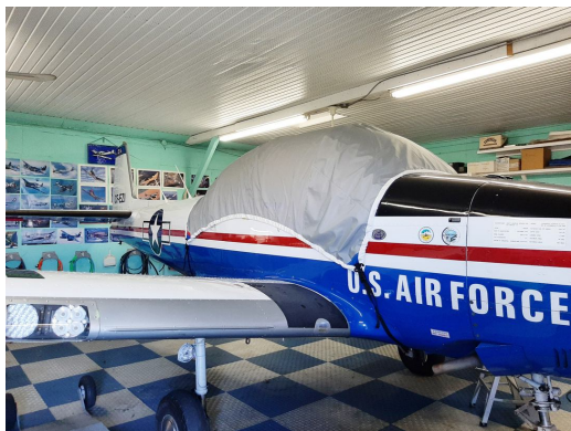
Navion L-17 Travel Cover, Light Weight Canopy Cover (w/without avionics bay extension)