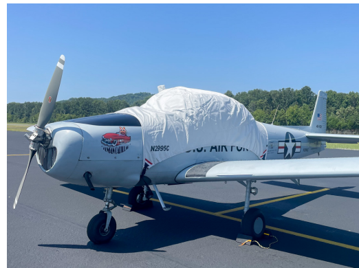
Navion L-17B Canopy Cover (With Avionics Bay Extension)