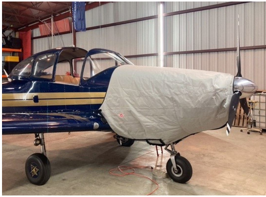
Navion Insulated Engine Cover