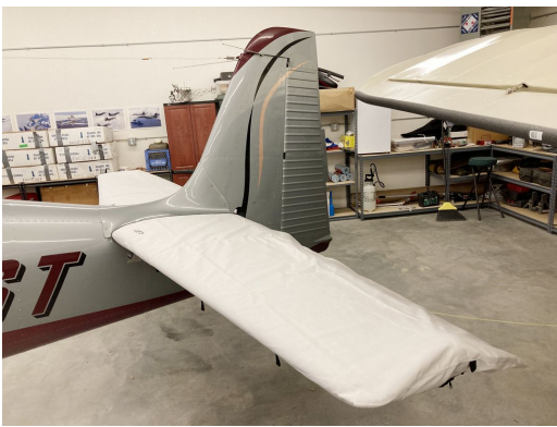
Navion Rangemaster Horizontal Stabilizer Covers

WINTER USE MATERIAL - Made with Solution-Dyed Polyester fabric, this option is intended for seasonal use to aid in deicing, rain mitigation, or for occasional travel. The material is lighter and more compact, but more susceptible to UV damage and may have a shorter useful life if used continuously outside than the all-year use material.