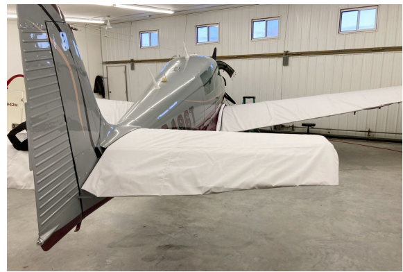
Navion Rangemaster Wing & Horizontal Stabilizer Covers