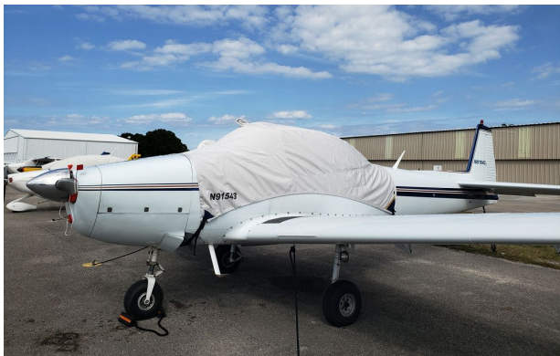
Ryan Navion Canopy Cover with Avionics Bay Extension

This cover type is made from Silver Acrylic Sunbrella canvas and is 100% lined with a soft and smooth microfiber. Bruce's Custom Covers developed this material combination especially for aircraft protection. The outer material is medium weight and treated for water resistance, UV resistance and anti-static buildup. The inner lining is a very soft and smooth microfiber to prevent scratching. The material is very reflective, and tests show that the cabin interior temperature can be reduced to near-ambient temperature on the hottest of days. It is water, ice and snow repellent, yet breathable to allow moisture to escape from between the cover and the aircraft surface.