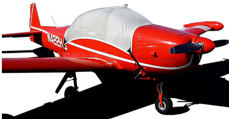
Navion Standard Canopy Cover on Long Slope Windshield Model