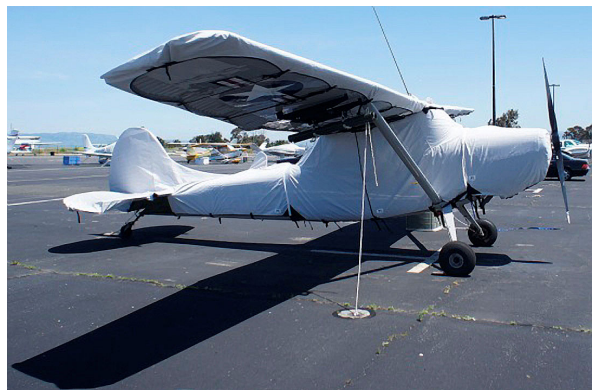
Wing Covers on Cessna Bird Dog

WINTER USE MATERIAL - Made with Solution-Dyed Polyester fabric, this option is intended for seasonal use to aid in deicing, rain mitigation, or for occasional travel. The material is lighter and more compact, but more susceptible to UV damage and may have a shorter useful life if used continuously outside than the all-year use material.