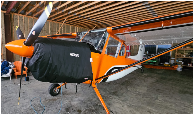
Cessna Bird Dog, L-19, O-1, 305 Insulated Engine Cover