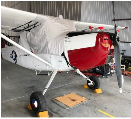
Cessna Bird Dog, L-19, O-1, 305 Canopy Cover, Over-Top Type