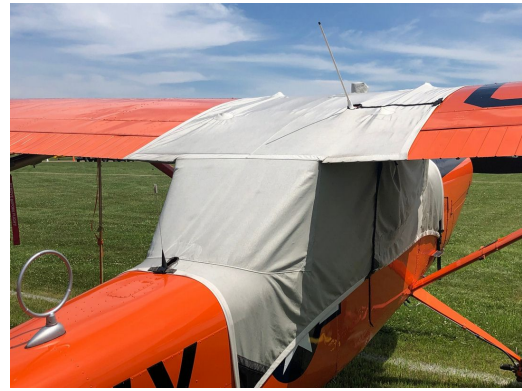
Cessna L-19 Bird Dog Over-Top Canopy Cover