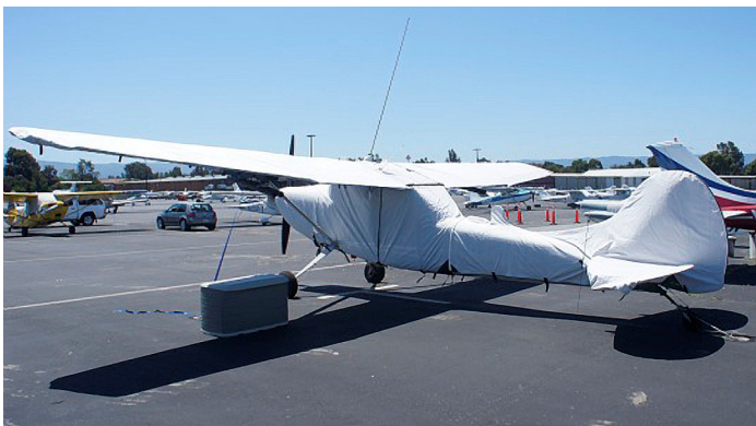
Cessna L-19 Extended Over-the-top Canopy, Engine, Empennage & Wing Covers