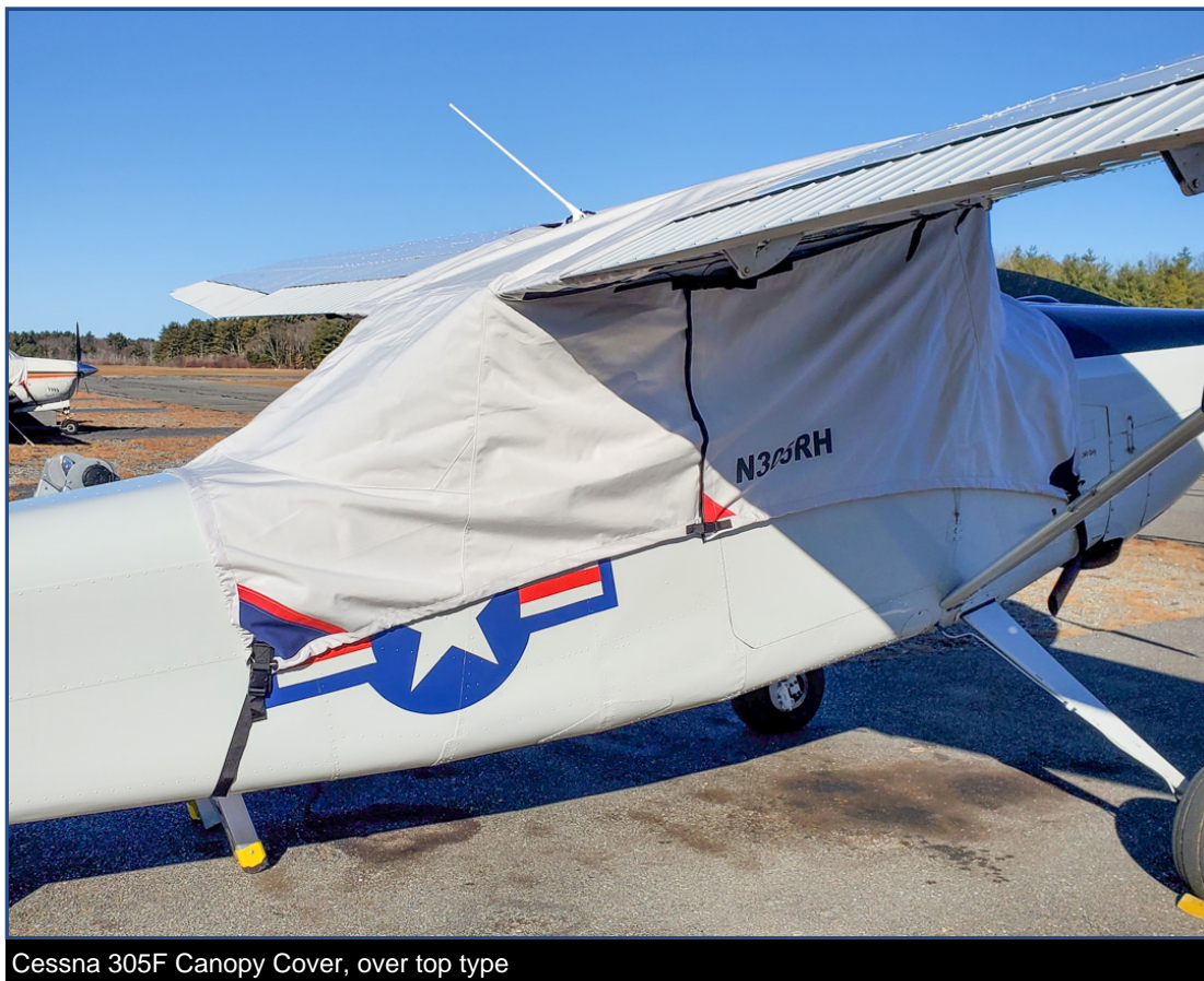
Cessna 305F Canopy Cover, over top type