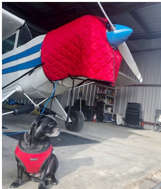
Piper PA-12 Insulated Hangar Blanket

This cover type is made from Silver Acrylic Sunbrella canvas and is 100% lined with a soft and smooth microfiber. Bruce's Custom Covers developed this material combination especially for aircraft protection. The outer material is medium weight and treated for water resistance, UV resistance and anti-static buildup. The inner lining is a very soft and smooth microfiber to prevent scratching. The material is very reflective, and tests show that the cabin interior temperature can be reduced to near-ambient temperature on the hottest of days. It is water, ice and snow repellent, yet breathable to allow moisture to escape from between the cover and the aircraft surface.