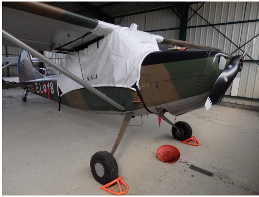
Cessna L-19 Bird Dog Canopy Cover