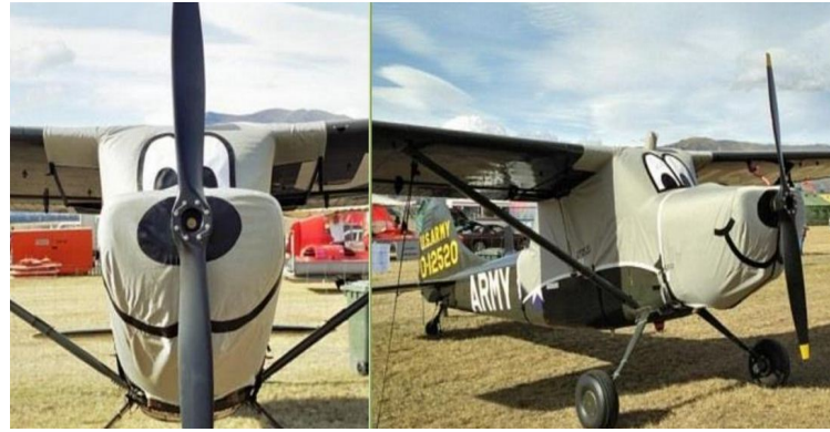
Cessna L-19 Bird Dog Canopy Cover, Engine Cover