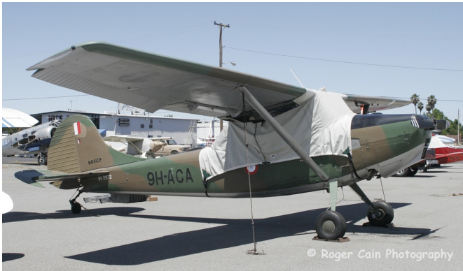
Cessna Bird Dog, L-19, O-1, 305 Canopy Cover, Over-Top Type