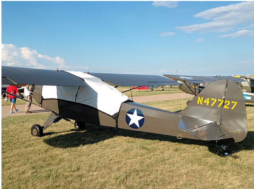
Taylorcraft L-2 Canopy Cover