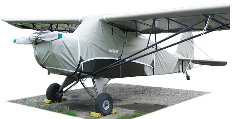
Taylorcraft L-2 Grasshopper Prop, Engine, Canopy, Wing and Empennage Covers Prop Cover, Engine Cover, Canopy Cover, Wing Covers and Empennage Cover