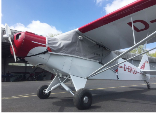
Piper Super Cub Travel Weight Canopy Cover

This cover type is made from Silver Acrylic Sunbrella canvas and is 100% lined with a soft and smooth microfiber. Bruce's Custom Covers developed this material combination especially for aircraft protection. The outer material is medium weight and treated for water resistance, UV resistance and anti-static buildup. The inner lining is a very soft and smooth microfiber to prevent scratching. The material is very reflective, and tests show that the cabin interior temperature can be reduced to near-ambient temperature on the hottest of days. It is water, ice and snow repellent, yet breathable to allow moisture to escape from between the cover and the aircraft surface.