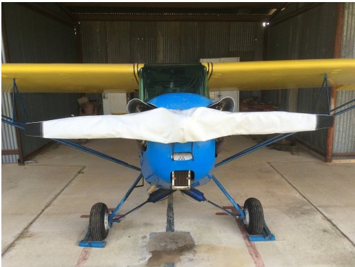
Taylorcraft L-2 Grasshopper Propellor/Spinner Cover