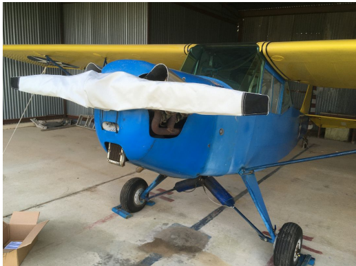
Taylorcraft L-2 Grasshopper Propellor/Spinner Cover

This cover type is made from Silver Acrylic Sunbrella canvas and is 100% lined with a soft and smooth microfiber. Bruce's Custom Covers developed this material combination especially for aircraft protection. The outer material is medium weight and treated for water resistance, UV resistance and anti-static buildup. The inner lining is a very soft and smooth microfiber to prevent scratching. The material is very reflective, and tests show that the cabin interior temperature can be reduced to near-ambient temperature on the hottest of days. It is water, ice and snow repellent, yet breathable to allow moisture to escape from between the cover and the aircraft surface.