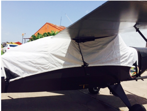
Taylorcraft L-2 Canopy Cover

This cover type is made from Silver Acrylic Sunbrella canvas and is 100% lined with a soft and smooth microfiber. Bruce's Custom Covers developed this material combination especially for aircraft protection. The outer material is medium weight and treated for water resistance, UV resistance and anti-static buildup. The inner lining is a very soft and smooth microfiber to prevent scratching. The material is very reflective, and tests show that the cabin interior temperature can be reduced to near-ambient temperature on the hottest of days. It is water, ice and snow repellent, yet breathable to allow moisture to escape from between the cover and the aircraft surface.