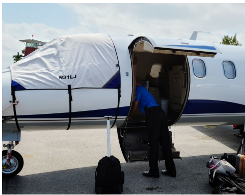
Lear 31A Cockpit Cover