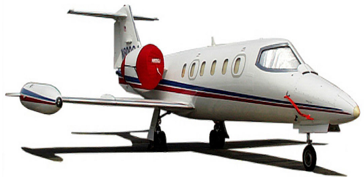
Lear 35 Engine Covers, Pitot Covers & Cockpit HeatShields