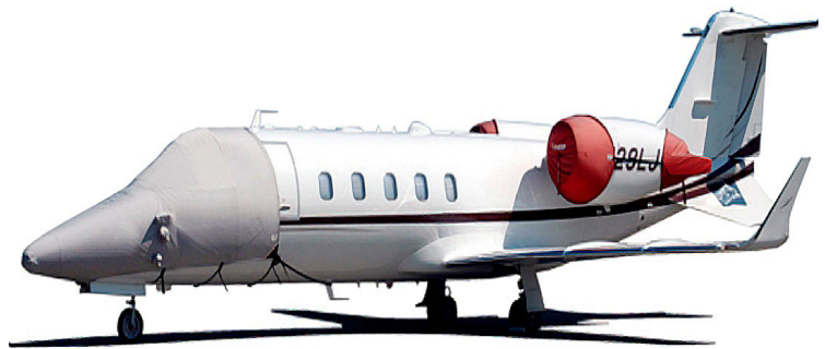
Lear 45 Windshield/Nose & Engine Cover Set