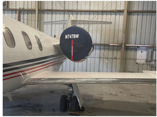
Lear 35A Engine Covers