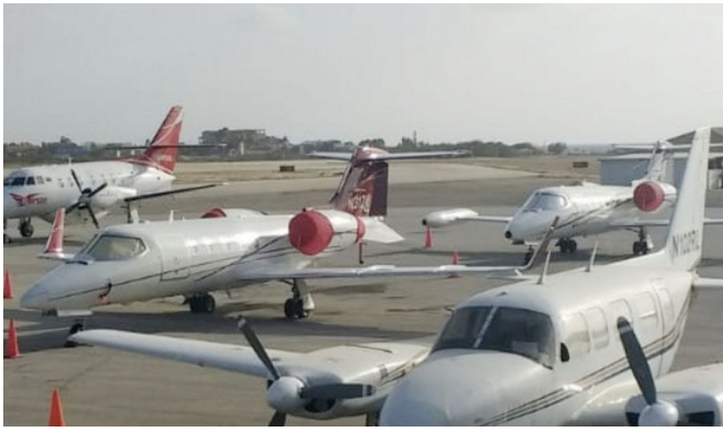
Engine Covers on a Lear 31