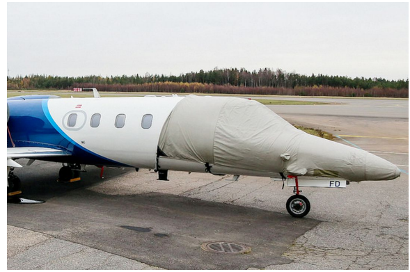
Learjet Cockpit/Nose Cover