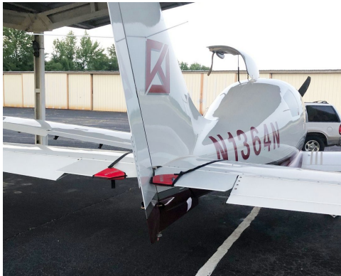
Lancair Columbia Rudder Gust Pad