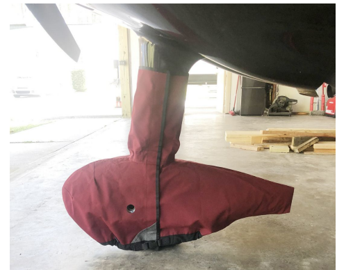
Cessna Corvalis, Lancair Columbia Wheelpant & Strut Cover