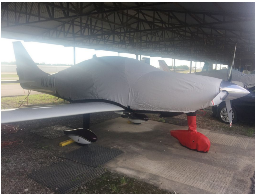
Lancair Columbia Extended Canopy/Engine Cover, Nose Wheelpant Cover

ALL-YEAR USE MATERIAL - Made with Silver Acrylic Sunbrella canvas, the all-year use material is the best option for sun protection and cover longevity. This heavier more durable material is intended for all weather conditions, such as rain and snow or lots of sun.