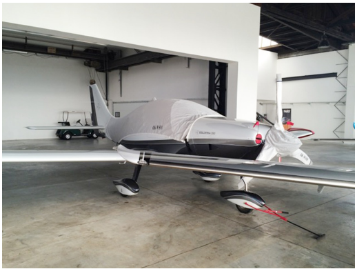
Cessna 350/400 Canopy Cover, extended to tail, Prop Cover, Plugs