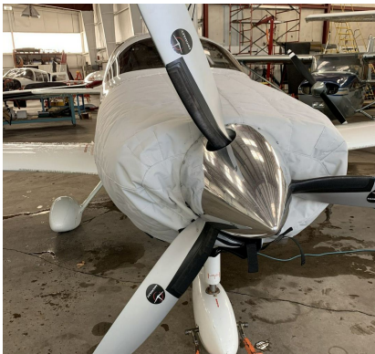
Cessna Corvallis Insulated Engine Cover

This cover type is made from Silver Acrylic Sunbrella canvas and is 100% lined with a soft and smooth microfiber. Bruce's Custom Covers developed this material combination especially for aircraft protection. The outer material is medium weight and treated for water resistance, UV resistance and anti-static buildup. The inner lining is a very soft and smooth microfiber to prevent scratching. The material is very reflective, and tests show that the cabin interior temperature can be reduced to near-ambient temperature on the hottest of days. It is water, ice and snow repellent, yet breathable to allow moisture to escape from between the cover and the aircraft surface.