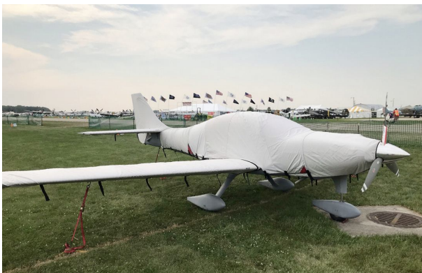
Lancair Columbia Complete Cover Set210

WINTER USE MATERIAL - Made with Solution-Dyed Polyester fabric, this option is intended for seasonal use to aid in deicing, rain mitigation, or for occasional travel. The material is lighter and more compact, but more susceptible to UV damage and may have a shorter useful life if used continuously outside than the all-year use material.