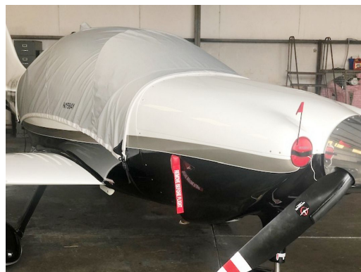
Columbia 350 Travel Cover, Engine Plugs