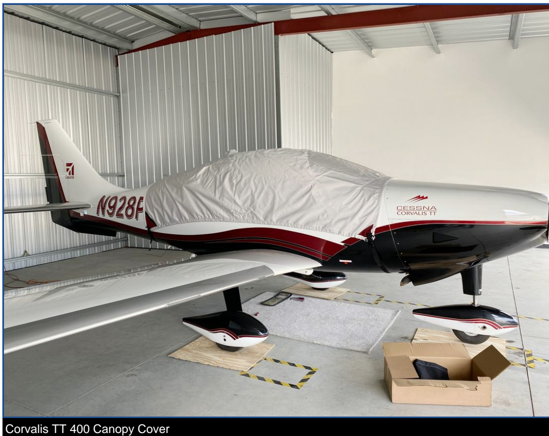
Corvalis TT 400 Canopy Cover