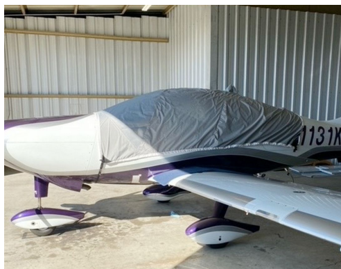
Lancair Columbia 400 Travel Canopy Cover

Travel Covers are made with Silver Solution-Dyed Polyester fabric and only lined over the windshield to save weight. The material is lightweight and more compact for easy stowage in the aircraft. The polyester material is water resistant, but only intended for occasional use outside. We also have an ultra lightweight material available for fitted hangar dust covers. For daily outdoor use, the non-travel Sunbrella Cover is the best choice.