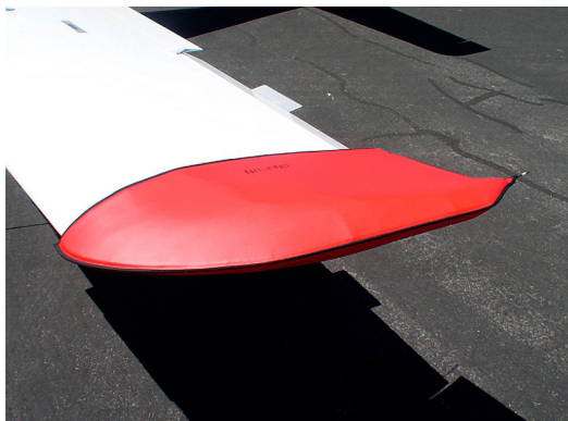
Cessna 350/400 Wingtip Pads

Designed to prevent damage to the aircraft extremities in crowded hangars, these products are made of bright red Naugahyde and thickly padded with a sandwich of closed cell foam.