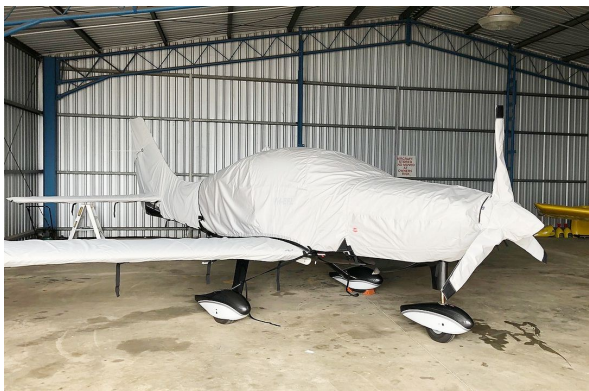
Columbia 350 Full Cover Set