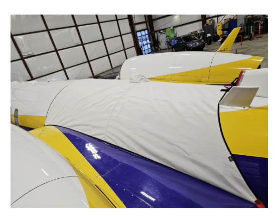
Lear 45 Empennage Saddle Cover W/ Dorsal Inlet Plug (Covers Upper Fuselage Between Pylons, Acm/Apu Area)