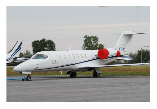
Lear 45 Engine Covers