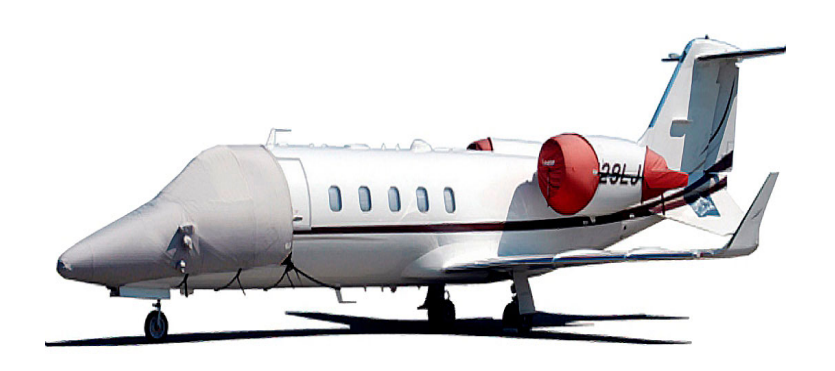
Lear 45 Windshield/Nose & Engine Cover Set