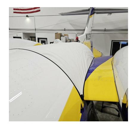
Lear 45 Empennage Saddle Cover W/ Dorsal Inlet Plug (Covers Upper Fuselage Between Pylons, Acm/Apu Area)

WINTER USE MATERIAL - Made with Solution-Dyed Polyester fabric, this option is intended for seasonal use to aid in deicing, rain mitigation, or for occasional travel. The material is lighter and more compact, but more susceptible to UV damage and may have a shorter useful life if used continuously outside than the all-year use material.