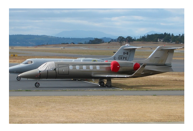
Lear 31A Cockpit Cover, Engine Covers

The Lear Models 40 & 45 Bikini Style Engine Covers are a single-piece design using a soft and smooth stretchy and fabric. The cover stretches tightly over both the intake and exhaust, installing quickly and easily. These covers are designed to be used as hangar dust covers and have a useful life of approximately one year.