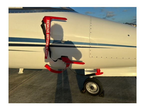
Lear 45 Pitot Cover Set

The Engine Inlet Plugs are custom fit for your Lear Models 40 & 45 intakes, made with heavy-duty vinyl material, and stuffed with a single block of sculpted urethane foam. Each plug has a zipper that allows the foam to be removed and dried if necessary. Engine plugs have 'remove before flight' streamers sewn onto the face of the plugs. Most plugs are imprinted with the aircraft registration number in black for an extra charge. Storage bag NOT included. Engine plugs may be inserted after flight when the engine is still warm. Engine Inlet Plugs are commonly referred to as Cowl Plugs, Intake Plugs, Cowl Blocks, Engine Blocks, and Engine Bungs.