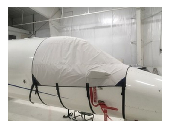
Lear 45 Cockpit Cover