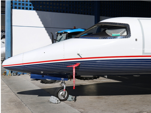
Lear Pitot Cover

The Engine Inlet Plugs are custom fit for your Lear 55 intakes, made with heavy-duty vinyl material, and stuffed with a single block of sculpted urethane foam. Each plug has a zipper that allows the foam to be removed and dried if necessary. Engine plugs have 'remove before flight' streamers sewn onto the face of the plugs. Most plugs are imprinted with the aircraft registration number in black for an extra charge. Storage bag NOT included. Engine plugs may be inserted after flight when the engine is still warm. Engine Inlet Plugs are commonly referred to as Cowl Plugs, Intake Plugs, Cowl Blocks, Engine Blocks, and Engine Bungs.