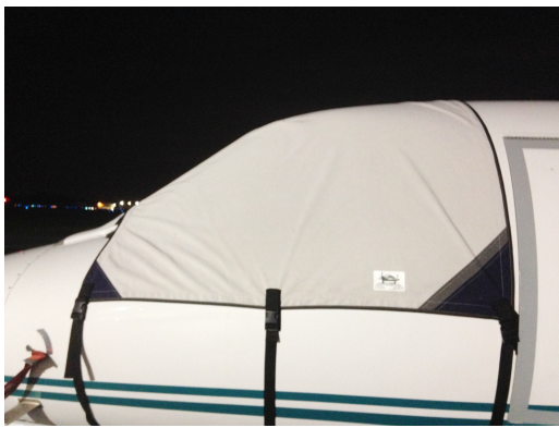
Lear 31 Cockpit Cover

This cover type is made from Silver Acrylic Sunbrella canvas and is 100% lined with a soft and smooth microfiber. Bruce's Custom Covers developed this material combination especially for aircraft protection. The outer material is medium weight and treated for water resistance, UV resistance and anti-static buildup. The inner lining is a very soft and smooth microfiber to prevent scratching. The material is very reflective, and tests show that the cabin interior temperature can be reduced to near-ambient temperature on the hottest of days. It is water, ice and snow repellent, yet breathable to allow moisture to escape from between the cover and the aircraft surface.