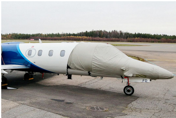
Learjet Cockpit/Nose Cover

This cover type is made from Silver Acrylic Sunbrella canvas and is 100% lined with a soft and smooth microfiber. Bruce's Custom Covers developed this material combination especially for aircraft protection. The outer material is medium weight and treated for water resistance, UV resistance and anti-static buildup. The inner lining is a very soft and smooth microfiber to prevent scratching. The material is very reflective, and tests show that the cabin interior temperature can be reduced to near-ambient temperature on the hottest of days. It is water, ice and snow repellent, yet breathable to allow moisture to escape from between the cover and the aircraft surface.