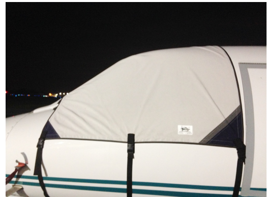
Lear 31 Cockpit Cover