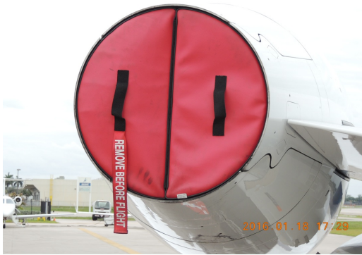
Embraer Legacy 500 Engine Exhaust Plug, folding type

The Engine Inlet Plugs are custom fit for your Embraer Legacy 500 Praetor, (EMB-545/550) intakes, made with heavy-duty vinyl material, and stuffed with a single block of sculpted urethane foam. Each plug has a zipper that allows the foam to be removed and dried if necessary. Engine plugs have 'remove before flight' streamers sewn onto the face of the plugs. Most plugs are imprinted with the aircraft registration number in black for an extra charge. Storage bag NOT included. Engine plugs may be inserted after flight when the engine is still warm. Engine Inlet Plugs are commonly referred to as Cowl Plugs, Intake Plugs, Cowl Blocks, Engine Blocks, and Engine Bungs.