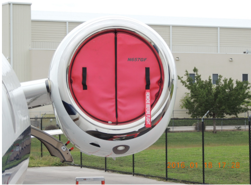
Embraer Legacy 500 Engine Inlet Plug, folding type

The Engine Inlet Plugs are custom fit for your Embraer Legacy 500 Praetor, (EMB-545/550) intakes, made with heavy-duty vinyl material, and stuffed with a single block of sculpted urethane foam. Each plug has a zipper that allows the foam to be removed and dried if necessary. Engine plugs have 'remove before flight' streamers sewn onto the face of the plugs. Most plugs are imprinted with the aircraft registration number in black for an extra charge. Storage bag NOT included. Engine plugs may be inserted after flight when the engine is still warm. Engine Inlet Plugs are commonly referred to as Cowl Plugs, Intake Plugs, Cowl Blocks, Engine Blocks, and Engine Bungs.