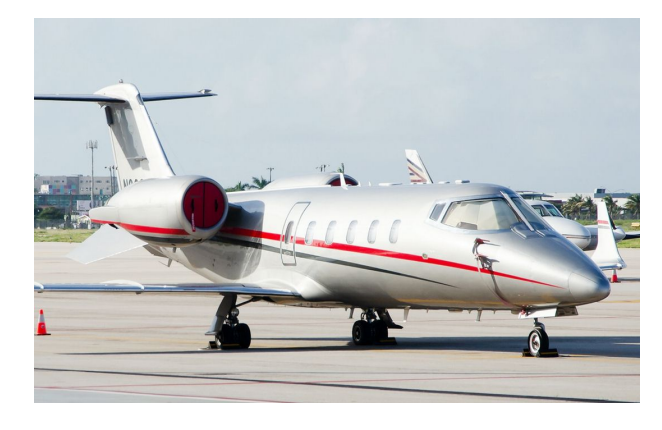
Lear 60 Cockpit Heatshields, Intake Plugs

Cockpit Heatshields are interior sunshades for the aircraft's cockpit. The product is a unique composite of closed-cell foam with a silver mylar finish. The semi-rigid design is stiff enough to stand inside the window framing. The set folds up flat and is easily stored in the included storage sleeve. Some designs may require velcro and suction cups. Our Heatshields for jets are offered white side out because some aircraft manufacturers have issued advisories against reflective window inserts due to potential heat damage. A Heatshield is an excellent short-term remedy for cockpit overheating, but an external fabric cover is more effective for long-term protection.