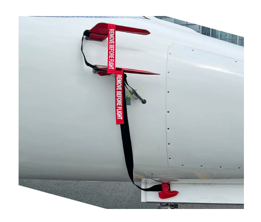
Lear 60 Pitot Covers W/Aoa Strap, Tat Covers, Heat Resistant Type