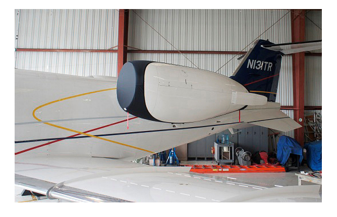
Lear 60 Engine Covers, "Bikini style"