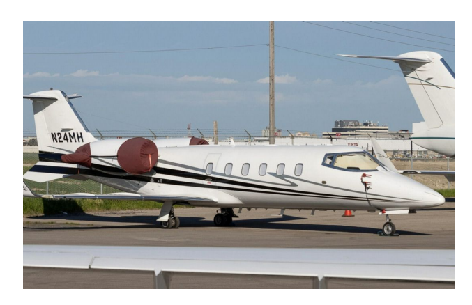
Lear 60 Cockpit Heatshields, Tri-Fold Engine Covers