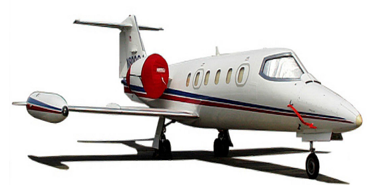
Lear 35 Engine Covers, Pitot Covers & Cockpit HeatShields

Lear 60 Engine Covers, Pitot Covers & Cockpit HeatShields