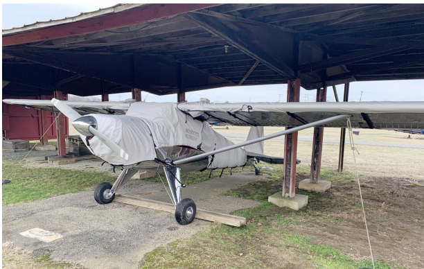
Luscombe Canopy, Wings, Engine & Empennage Covers