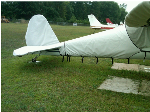
Luscombe Empennage Cover, two-piece design

WINTER USE MATERIAL - Made with Solution-Dyed Polyester fabric, this option is intended for seasonal use to aid in deicing, rain mitigation, or for occasional travel. The material is lighter and more compact, but more susceptible to UV damage and may have a shorter useful life if used continuously outside than the all-year use material.