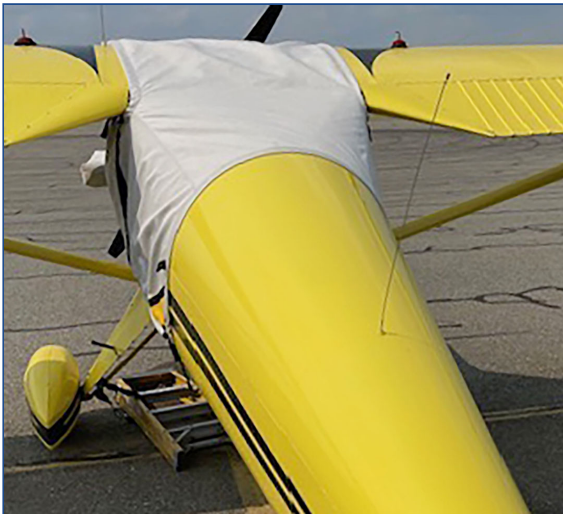
Luscombe 8A Canopy Cover, Over-Top