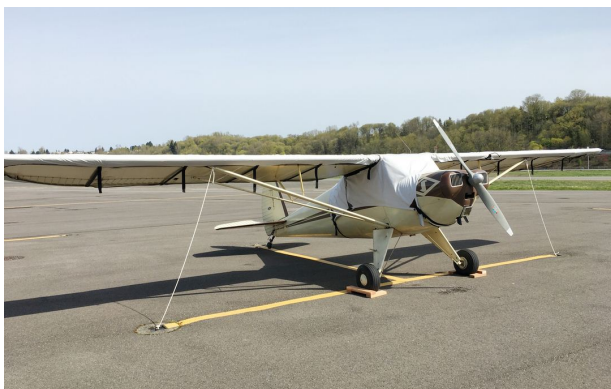
Luscombe Over-Top Canopy Cover & Wing Covers

This cover type is made from Silver Acrylic Sunbrella canvas and is 100% lined with a soft and smooth microfiber. Bruce's Custom Covers developed this material combination especially for aircraft protection. The outer material is medium weight and treated for water resistance, UV resistance and anti-static buildup. The inner lining is a very soft and smooth microfiber to prevent scratching. The material is very reflective, and tests show that the cabin interior temperature can be reduced to near-ambient temperature on the hottest of days. It is water, ice and snow repellent, yet breathable to allow moisture to escape from between the cover and the aircraft surface.