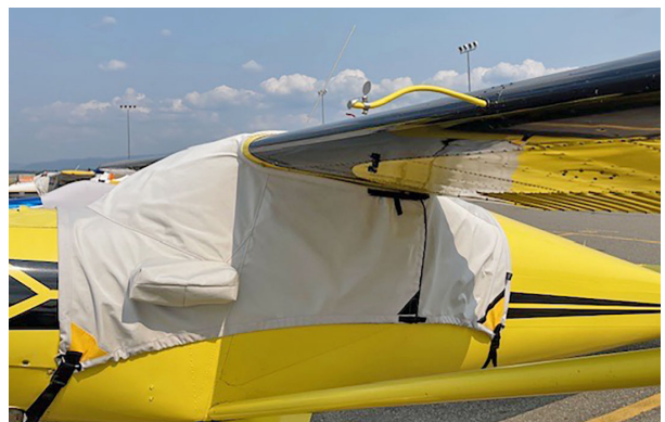
Luscombe 8A Canopy Cover, Over-Top