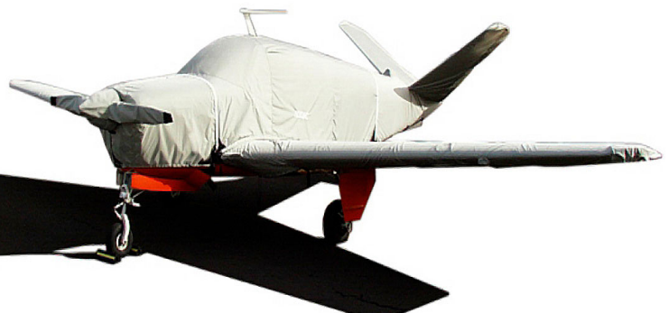
Beech Bonanza Full Cover Set