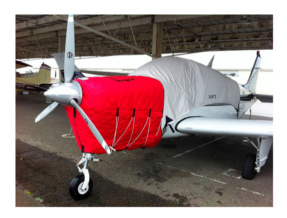
Beech Bonanza Insulated Engine Cover, fully enclosed