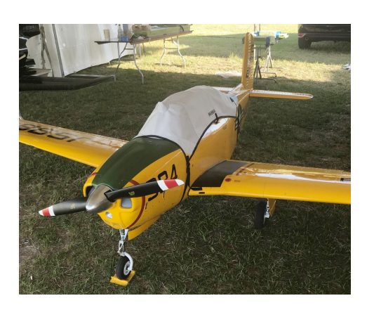
Beechcraft T-34B Mentor Canopy Cover, for 36% Scale Model