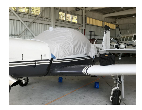
Valmet L-90 Canopy Cover

This cover type is made from Silver Acrylic Sunbrella canvas and is 100% lined with a soft and smooth microfiber. Bruce's Custom Covers developed this material combination especially for aircraft protection. The outer material is medium weight and treated for water resistance, UV resistance and anti-static buildup. The inner lining is a very soft and smooth microfiber to prevent scratching. The material is very reflective, and tests show that the cabin interior temperature can be reduced to near-ambient temperature on the hottest of days. It is water, ice and snow repellent, yet breathable to allow moisture to escape from between the cover and the aircraft surface.