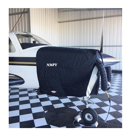
Beech Bonanza 36 Models Insulated Engine Cover

This cover type is made from Silver Acrylic Sunbrella canvas and is 100% lined with a soft and smooth microfiber. Bruce's Custom Covers developed this material combination especially for aircraft protection. The outer material is medium weight and treated for water resistance, UV resistance and anti-static buildup. The inner lining is a very soft and smooth microfiber to prevent scratching. The material is very reflective, and tests show that the cabin interior temperature can be reduced to near-ambient temperature on the hottest of days. It is water, ice and snow repellent, yet breathable to allow moisture to escape from between the cover and the aircraft surface.