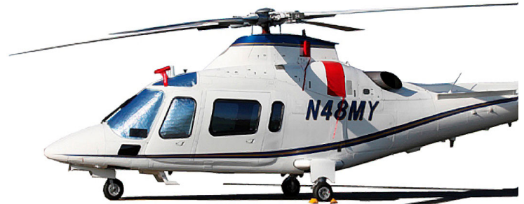
Agusta 109 Bubble, Rotor Hub & Blade Covers (illustration) Agusta Power Pitot Covers, Intake Covers, and Cockpit Heatshield set