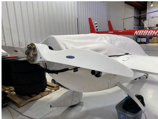
Rutan Long-EZ Canopy/Nose/Engine Cover

This cover type is made from Silver Acrylic Sunbrella canvas and is 100% lined with a soft and smooth microfiber. Bruce's Custom Covers developed this material combination especially for aircraft protection. The outer material is medium weight and treated for water resistance, UV resistance and anti-static buildup. The inner lining is a very soft and smooth microfiber to prevent scratching. The material is very reflective, and tests show that the cabin interior temperature can be reduced to near-ambient temperature on the hottest of days. It is water, ice and snow repellent, yet breathable to allow moisture to escape from between the cover and the aircraft surface.