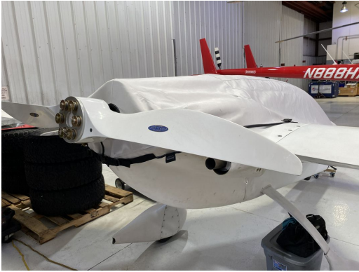
Rutan Long-EZ Canopy/Nose/Engine Cover

Travel Covers are made with Silver Solution-Dyed Polyester fabric and only lined over the windshield to save weight. The material is lightweight and more compact for easy stowage in the aircraft. The polyester material is water resistant, but only intended for occasional use outside. We also have an ultra lightweight material available for fitted hangar dust covers. For daily outdoor use, the non-travel Sunbrella Cover is the best choice.