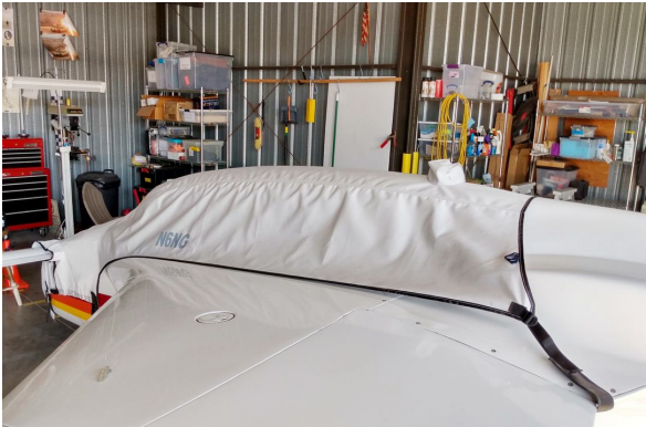
Rutan Long-EZ Canopy/Nose Cover