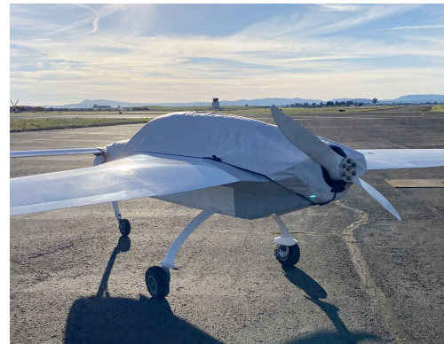
Rutan Long-EZ Canopy/Nose/Engine Cover