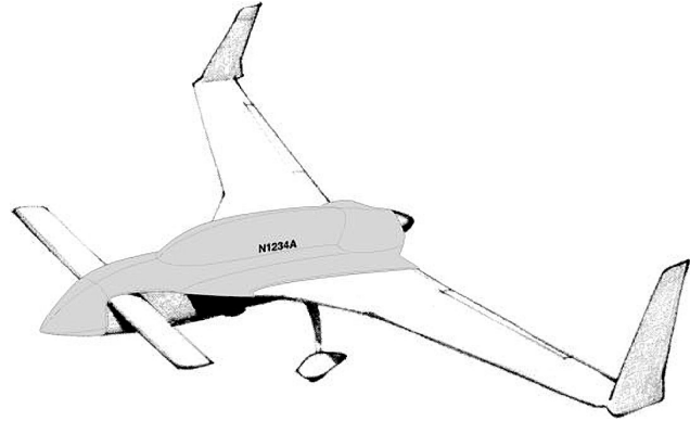
Rutan Long-EZ Canopy Cover