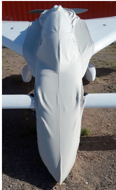
Rutan Long-EZ Canopy/Nose/Engine Cover