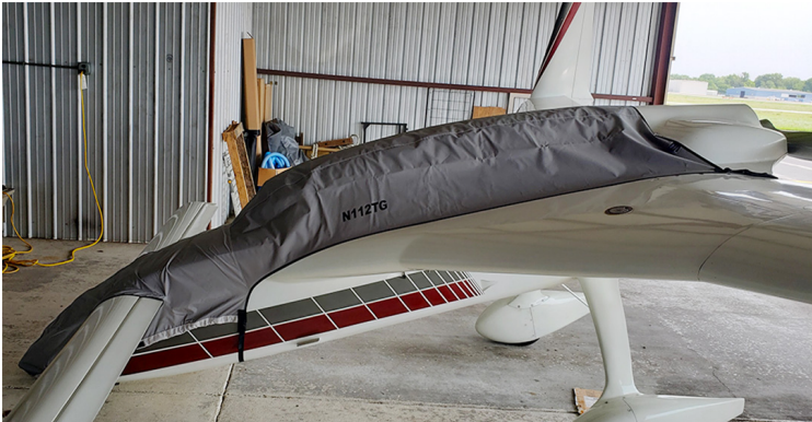
Rutan Long-EZ & Berkut Travel Cover, Light Weight Canopy/Nose Cover

Travel Covers are made with Silver Solution-Dyed Polyester fabric and only lined over the windshield to save weight. The material is lightweight and more compact for easy stowage in the aircraft. The polyester material is water resistant, but only intended for occasional use outside. We also have an ultra lightweight material available for fitted hangar dust covers. For daily outdoor use, the non-travel Sunbrella Cover is the best choice.