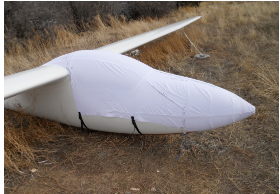
Laister LP-49 Canopy/Nose Cover, test fit cover