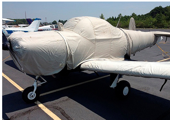
Ercoupe full cover set: Extended Canopy, Engine, Wing & Empennage covers

WINTER USE MATERIAL - Made with Solution-Dyed Polyester fabric, this option is intended for seasonal use to aid in deicing, rain mitigation, or for occasional travel. The material is lighter and more compact, but more susceptible to UV damage and may have a shorter useful life if used continuously outside than the all-year use material.