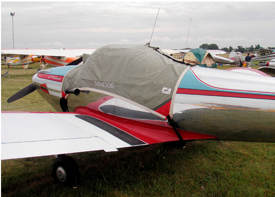
Ercoupe Canopy Cover, flat windshield model

the Canopy Cover and Engine Cover. This cover will enclose the engine cowl and will extend aft to cover all of the windows. This cover type is made from Silver Acrylic Sunbrella canvas and is 100% lined with a soft and smooth microfiber. Bruce's Custom Covers developed this material combination especially for aircraft protection. The outer material is medium weight and treated for water resistance, UV resistance and anti-static buildup. The inner lining is a very soft and smooth microfiber to prevent scratching. The material is very reflective, and tests show that the cabin interior temperature can be reduced to near-ambient temperature on the hottest of days. It is water, ice and snow repellent, yet breathable to allow moisture to escape from between the cover and the aircraft surface.