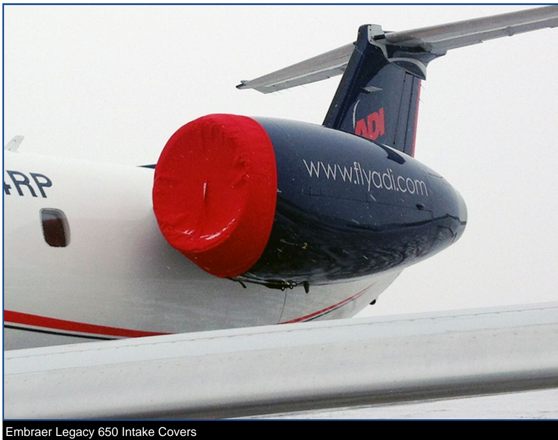
Embraer Legacy 650 Intake Covers