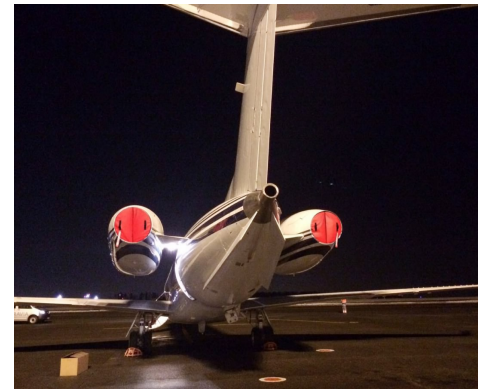
Embraer Legacy Exhaust Plugs