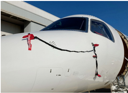
Embraer ERJ-135 Pitot/TAT/Ice Detector Covers

The Engine Inlet Plugs are custom fit for your Embraer ERJ-135/140/145 Legacy 600, 650 intakes, made with heavy-duty vinyl material, and stuffed with a single block of sculpted urethane foam. Each plug has a zipper that allows the foam to be removed and dried if necessary. Engine plugs have 'remove before flight' streamers sewn onto the face of the plugs. Most plugs are imprinted with the aircraft registration number in black for an extra charge. Storage bag NOT included. Engine plugs may be inserted after flight when the engine is still warm. Engine Inlet Plugs are commonly referred to as Cowl Plugs, Intake Plugs, Cowl Blocks, Engine Blocks, and Engine Bungs.