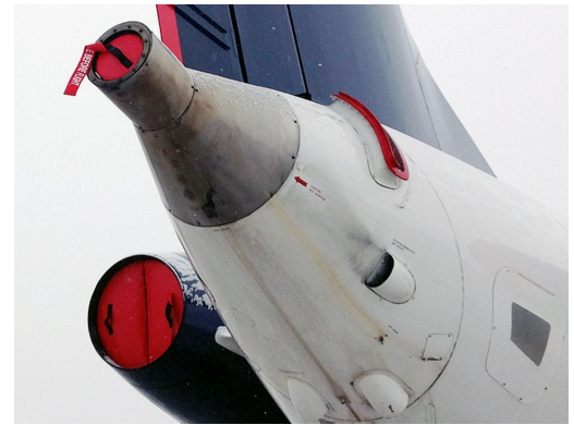
Embraer Legacy 650 APU and Engine Exhaust Plugs