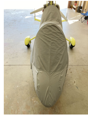
Magni M22 Cockpit/Nose Cover