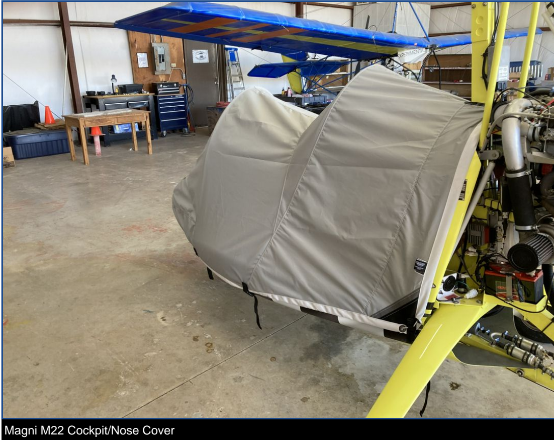
Magni M22 Cockpit/Nose Cover