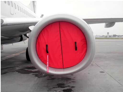
Boeing 737 Engine Intake Plug, Folding Type

The Engine Inlet Plugs are custom fit for your Embraer EMB-170/175 intakes, made with heavy-duty vinyl material, and stuffed with a single block of sculpted urethane foam. Each plug has a zipper that allows the foam to be removed and dried if necessary. Engine plugs have 'remove before flight' streamers sewn onto the face of the plugs. Most plugs are imprinted with the aircraft registration number in black for an extra charge. Storage bag NOT included. Engine plugs may be inserted after flight when the engine is still warm. Engine Inlet Plugs are commonly referred to as Cowl Plugs, Intake Plugs, Cowl Blocks, Engine Blocks, and Engine Bungs.