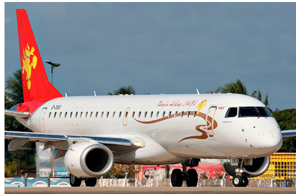
Covers, Plugs & HeatShields for Embraer 170/175/190/195