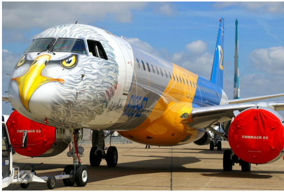
Embraer E195 Intake Covers