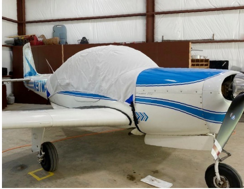
Meyers (Rockwell) 200 Canopy Cover

This cover type is made from Silver Acrylic Sunbrella canvas and is 100% lined with a soft and smooth microfiber. Bruce's Custom Covers developed this material combination especially for aircraft protection. The outer material is medium weight and treated for water resistance, UV resistance and anti-static buildup. The inner lining is a very soft and smooth microfiber to prevent scratching. The material is very reflective, and tests show that the cabin interior temperature can be reduced to near-ambient temperature on the hottest of days. It is water, ice and snow repellent, yet breathable to allow moisture to escape from between the cover and the aircraft surface.