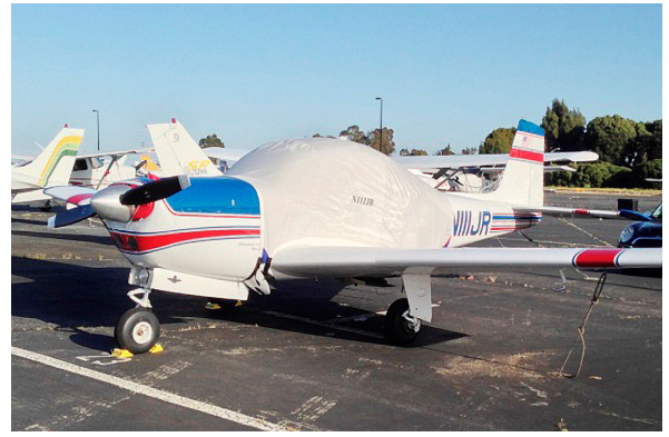
Meyers 200 Extended Canopy Cover & Engine Plugs