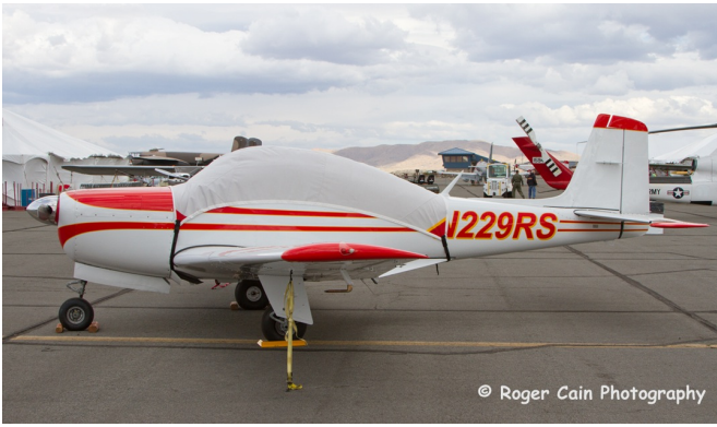
Meyer (Aero Commander) 200 Canopy Cover