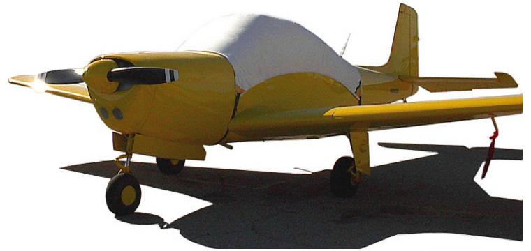
Meyer (Aero Commander) 200 Canopy Cover