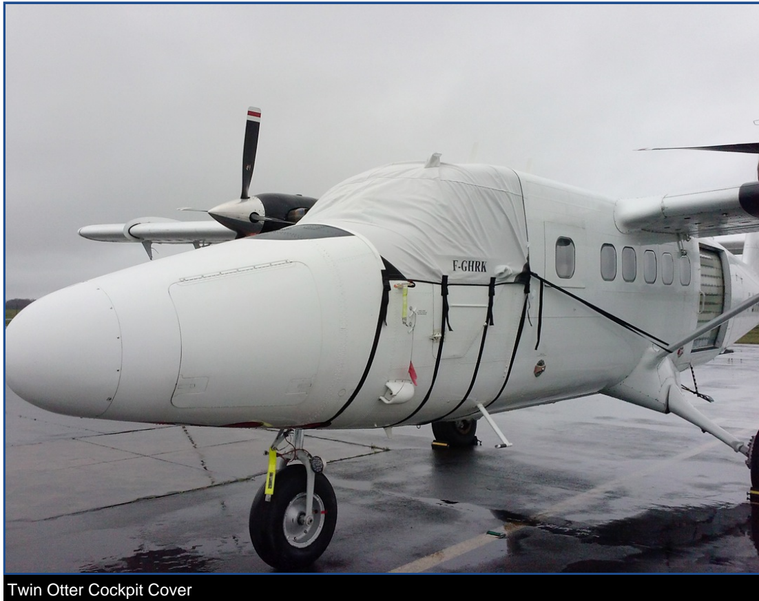
Twin Otter Cockpit Cover