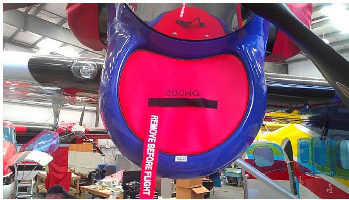
De Havilland Twin Otter Engine Inlet Plug and Exhaust Covers