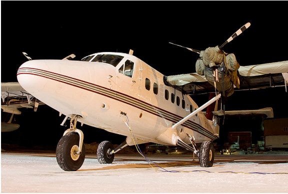
Twin Otter Wing, Horiz. Stab & Engine Covers

Covers developed this material combination especially for aircraft protection. The outer material is medium weight and treated for water resistance, UV resistance and anti-static buildup. The inner lining is a very soft and smooth microfiber to prevent scratching. The material is very reflective, and tests show that the cabin interior temperature can be reduced to near-ambient temperature on the hottest of days. It is water, ice and snow repellent, yet breathable to allow moisture to escape from between the cover and the aircraft surface.