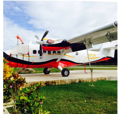
Twin Otter Cockpit Cover & Engine Plugs