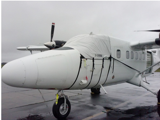
Twin Otter Cockpit Cover