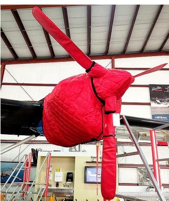
Twin Otter Wing, Horiz. Stab & Engine Covers De Havilland Twin Otter Insulated Engine & Insulated Propellor/Spinner Covers