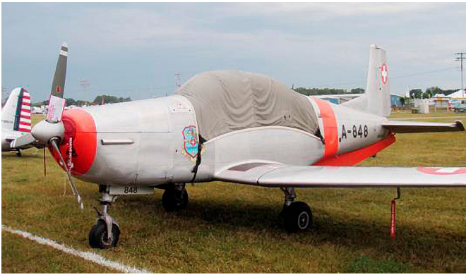
Pilatus P-3 Canopy Cover