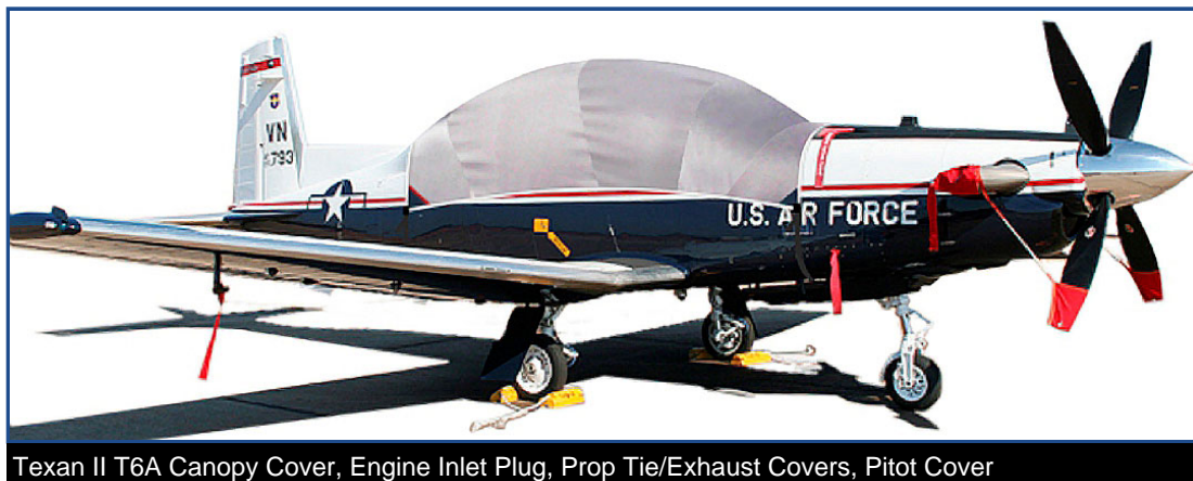
Texan II T6A Canopy Cover, Engine Inlet Plug, Prop Tie/Exhaust Covers, Pitot Cover