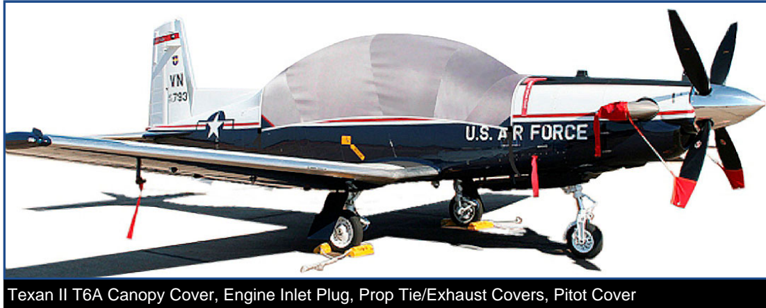
Texan II T6A Canopy Cover, Engine Inlet Plug, Prop Tie/Exhaust Covers, Pitot Cover