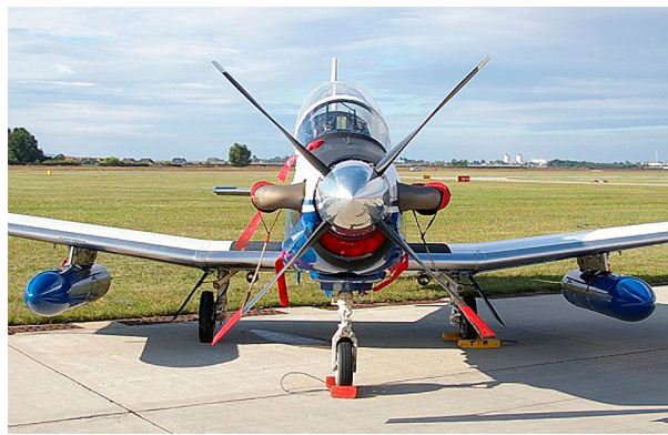
Texan II T6A Engine Inlet Plug, Prop Tie/Exhaust Covers