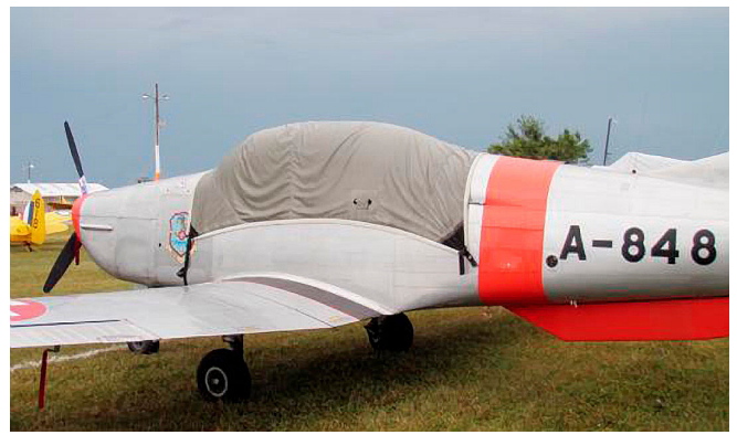
Pilatus P-3 Canopy Cover