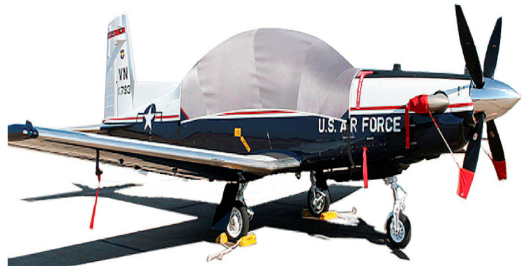
Texan II T6A Canopy Cover, Engine Inlet Plug, Prop Tie/Exhaust Covers, Pitot Cover