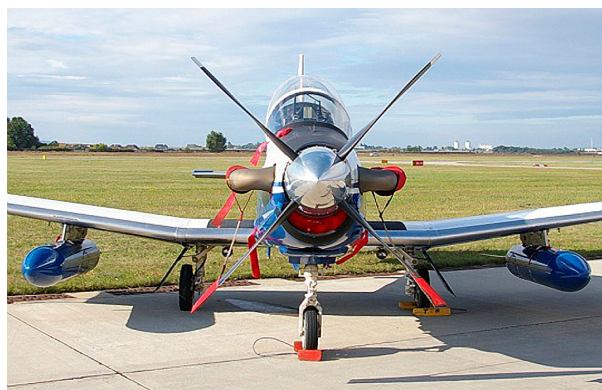
Texan II T6A Engine Inlet Plug, Prop Tie/Exhaust Covers