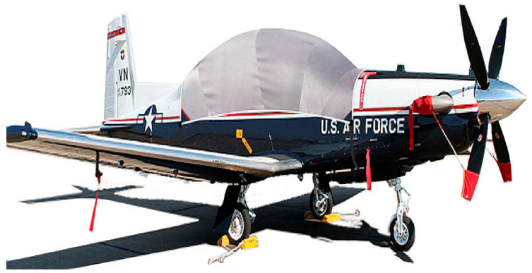
Texan II T6A Canopy Cover, Engine Inlet Plug, Prop Tie/Exhaust Covers, Pitot Cover