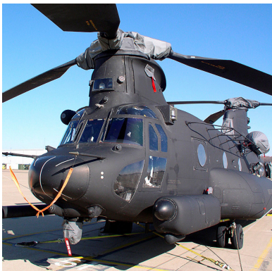
Boeing Vertol MH-47 Rotor Hubs, Engine & Other Covers

Insulated Covers Material - A special composite material of solution-dyed polyester, 3M Thinsulate insulation, and soft nylon interior fabric. Our insulated covers are designed to complement an engine preheater and help retain heat in the engine compartment after shutdown. If you operate your aircraft in cold-weather, these covers will help prevent engine wear and tear.