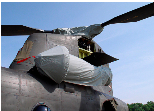
Boeing Vertol CH-47 Engine and Rotor Hub Covers

Insulated Covers Material - A special composite material of solution-dyed polyester, 3M Thinsulate insulation, and soft nylon interior fabric. Our insulated covers are designed to complement an engine preheater and help retain heat in the engine compartment after shutdown. If you operate your aircraft in cold-weather, these covers will help prevent engine wear and tear.