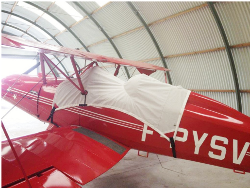
Starduster Too Canopy Cover