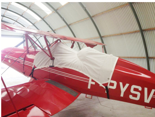
Starduster Too Canopy Cover

This cover type is made from Silver Acrylic Sunbrella canvas and is 100% lined with a soft and smooth microfiber. Bruce's Custom Covers developed this material combination especially for aircraft protection. The outer material is medium weight and treated for water resistance, UV resistance and anti-static buildup. The inner lining is a very soft and smooth microfiber to prevent scratching. The material is very reflective, and tests show that the cabin interior temperature can be reduced to near-ambient temperature on the hottest of days. It is water, ice and snow repellent, yet breathable to allow moisture to escape from between the cover and the aircraft surface.