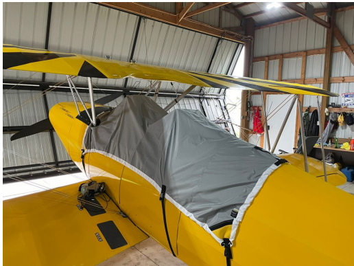
Marquardt Charger Travel Weight Canopy Cover

This cover type is made from Silver Acrylic Sunbrella canvas and is 100% lined with a soft and smooth microfiber. Bruce's Custom Covers developed this material combination especially for aircraft protection. The outer material is medium weight and treated for water resistance, UV resistance and anti-static buildup. The inner lining is a very soft and smooth microfiber to prevent scratching. The material is very reflective, and tests show that the cabin interior temperature can be reduced to near-ambient temperature on the hottest of days. It is water, ice and snow repellent, yet breathable to allow moisture to escape from between the cover and the aircraft surface.