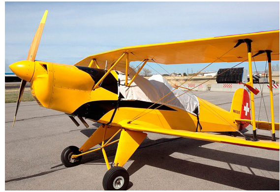
Bucker Jungmann Canopy Cover