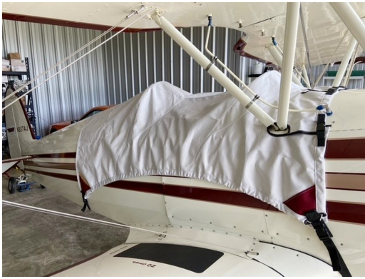
Marquardt Charger Cockpit Cover