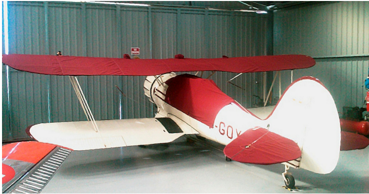
Waco UPF-7 Upper Wing Cover, Horizontal Stabilizer Cover & Canopy Cover

WINTER USE MATERIAL - Made with Solution-Dyed Polyester fabric, this option is intended for seasonal use to aid in deicing, rain mitigation, or for occasional travel. The material is lighter and more compact, but more susceptible to UV damage and may have a shorter useful life if used continuously outside than the all-year use material.