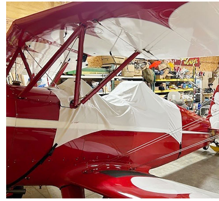
Marquardt Charger MA-5 Cockpit Cover