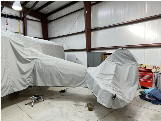
Stearman PT-13 Full Body Dust Cover, Prop Cover Included