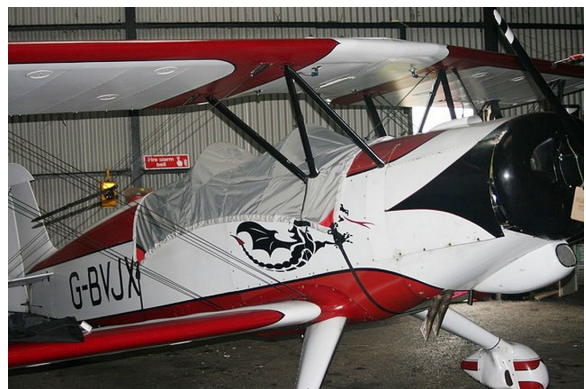
Marquardt Charger MA-5 Light Weight Travel Cockpit Cover