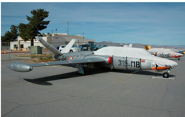
Fouga Magister Canopy/Nose Cover & Tail Stabilizer Covers

WINTER USE MATERIAL - Made with Solution-Dyed Polyester fabric, this option is intended for seasonal use to aid in deicing, rain mitigation, or for occasional travel. The material is lighter and more compact, but more susceptible to UV damage and may have a shorter useful life if used continuously outside than the all-year use material.