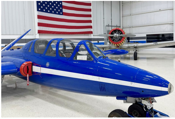
Fouga Magister CM170 Intake Plugs