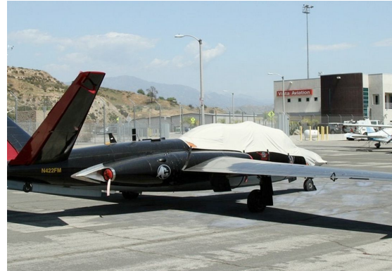
Fouga Magister Canopy/Nose Cover with nose mount loop antenna