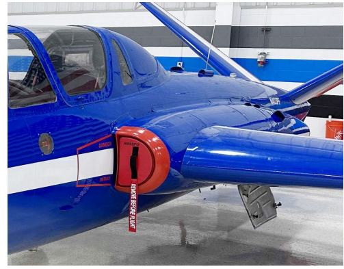
Fouga Magister CM170 Intake Plugs