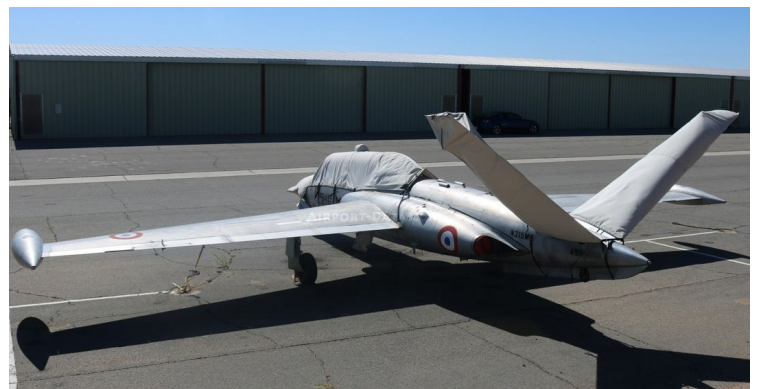
Fouga Magister Canopy/Nose Cover, Tail Stabilizer Covers