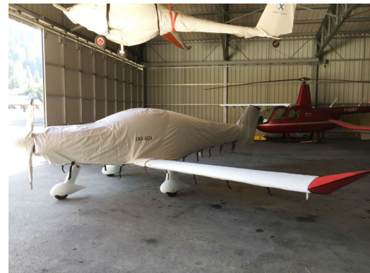
Dynaero MCR.4 Pickup Complete Cover Set.