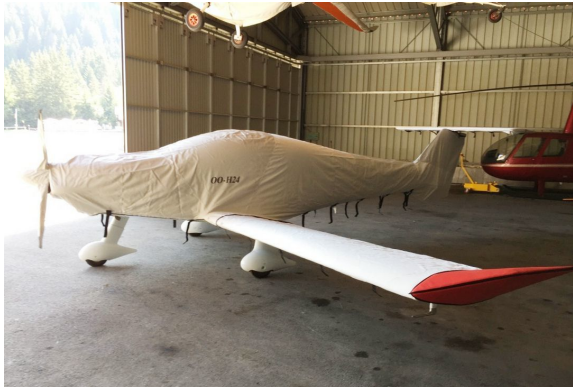
Dynaero MCR.4 Pickup Complete Cover Set.

WINTER USE MATERIAL - Made with Solution-Dyed Polyester fabric, this option is intended for seasonal use to aid in deicing, rain mitigation, or for occasional travel. The material is lighter and more compact, but more susceptible to UV damage and may have a shorter useful life if used continuously outside than the all-year use material.