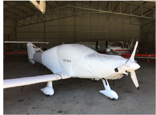
Dynaero MCR.4 Pickup Complete Cover Set.