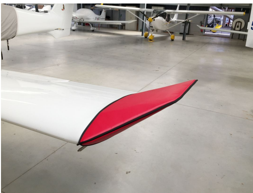
Dynaero MCR Pickup Wingtip Pads

Designed to prevent damage to the aircraft extremities in crowded hangars, these products are made of bright red Naugahyde and thickly padded with a sandwich of closed cell foam.