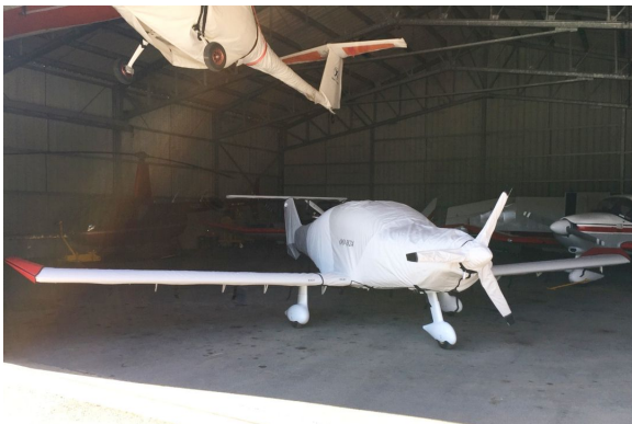
Dynaero MCR.4 Pickup Complete Cover Set.

This cover type is made from Silver Acrylic Sunbrella canvas and is 100% lined with a soft and smooth microfiber. Bruce's Custom Covers developed this material combination especially for aircraft protection. The outer material is medium weight and treated for water resistance, UV resistance and anti-static buildup. The inner lining is a very soft and smooth microfiber to prevent scratching. The material is very reflective, and tests show that the cabin interior temperature can be reduced to near-ambient temperature on the hottest of days. It is water, ice and snow repellent, yet breathable to allow moisture to escape from between the cover and the aircraft surface.