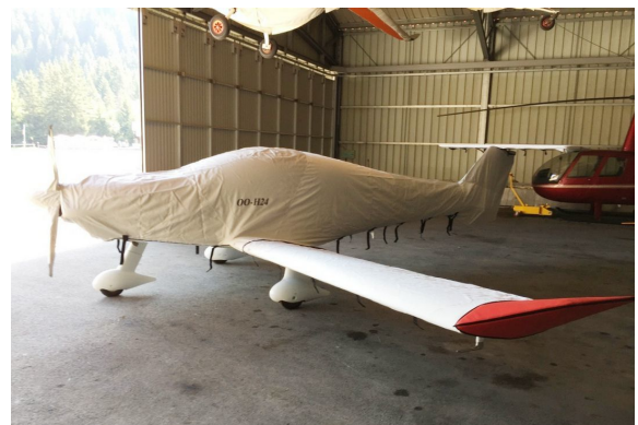
Dynaero MCR.4 Pickup Complete Cover Set.