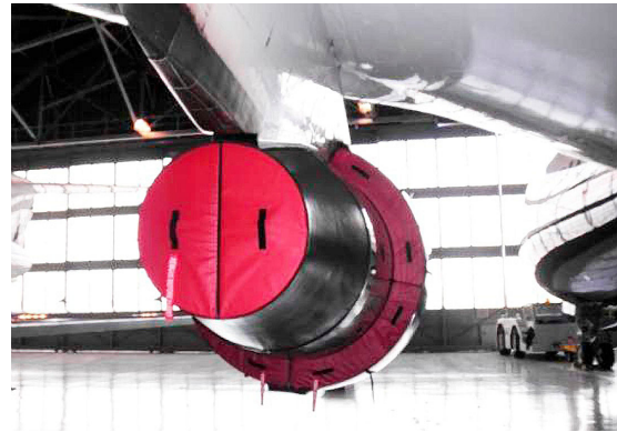
Exhaust Plugs Ship Set, incl. Fan Thrust Reverser and Exhaust Plugs P/N: B767-200