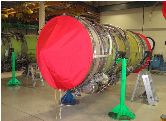
PW JT8D Off-Link Engine Shower Cap Cover Set