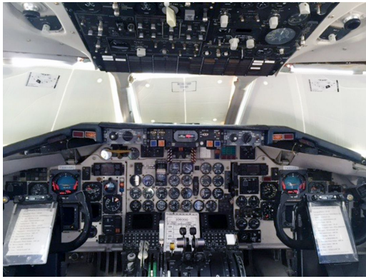
McDonnell Douglas MD80 Cockpit Heatshield Set