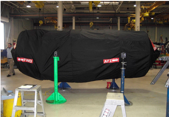
PW JT8D Off-Link Engine Transport Cover (no nose cone, no TR's), fully enclosed

material, and stuffed with a single block of sculpted urethane foam. Each plug has a zipper that allows the foam to be removed and dried if necessary. Engine plugs have 'remove before flight' streamers sewn onto the face of the plugs. Most plugs are imprinted with the aircraft registration number in black for an extra charge. Storage bag NOT included. Engine plugs may be inserted after flight when the engine is still warm. Engine Inlet Plugs are commonly referred to as Cowl Plugs, Intake Plugs, Cowl Blocks, Engine Blocks, and Engine Bungs.