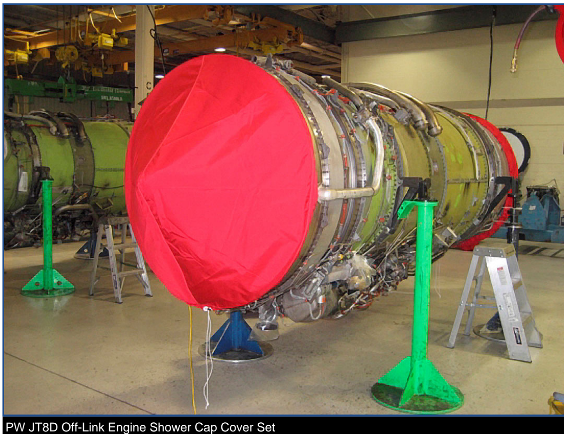
PW JT8D Off-Link Engine Shower Cap Cover Set