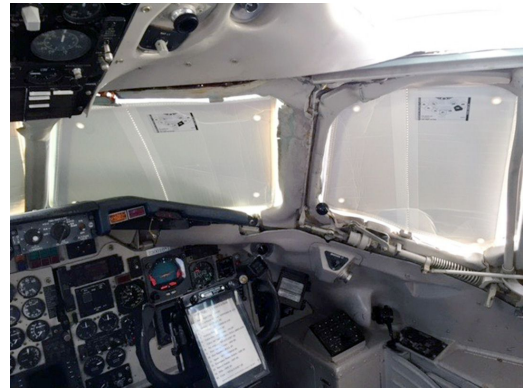
McDonnell Douglas MD80 Cockpit Heatshield Set