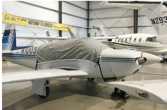
Mooney 201 Travel Cover, Light Weight Travel Canopy Cover, 5 Lbs