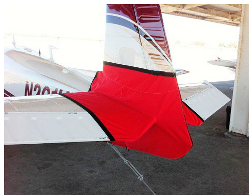
Mooney Tailcone Cover, completely enclosed