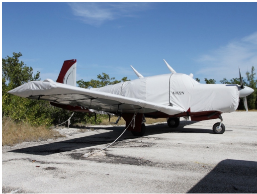
Mooney M20C Extended Canopy/Engine & Wing Covers

This cover type is made from Silver Acrylic Sunbrella canvas and is 100% lined with a soft and smooth microfiber. Bruce's Custom Covers developed this material combination especially for aircraft protection. The outer material is medium weight and treated for water resistance, UV resistance and anti-static buildup. The inner lining is a very soft and smooth microfiber to prevent scratching. The material is very reflective, and tests show that the cabin interior temperature can be reduced to near-ambient temperature on the hottest of days. It is water, ice and snow repellent, yet breathable to allow moisture to escape from between the cover and the aircraft surface.