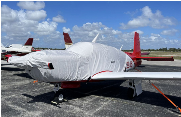
Mooney M20K Extended Canopy/Engine Cover, Prop Cover

This cover type is made from Silver Acrylic Sunbrella canvas and is 100% lined with a soft and smooth microfiber. Bruce's Custom Covers developed this material combination especially for aircraft protection. The outer material is medium weight and treated for water resistance, UV resistance and anti-static buildup. The inner lining is a very soft and smooth microfiber to prevent scratching. The material is very reflective, and tests show that the cabin interior temperature can be reduced to near-ambient temperature on the hottest of days. It is water, ice and snow repellent, yet breathable to allow moisture to escape from between the cover and the aircraft surface.