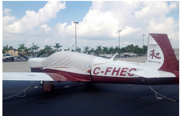
Mooney TLS Canopy Cover