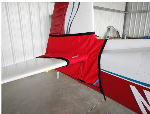
Mooney Tailcone Cover

WINTER USE MATERIAL - Made with Solution-Dyed Polyester fabric, this option is intended for seasonal use to aid in deicing, rain mitigation, or for occasional travel. The material is lighter and more compact, but more susceptible to UV damage and may have a shorter useful life if used continuously outside than the all-year use material.