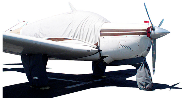
Beech Bonanza/Debonair/Baron Landing Gear Covers