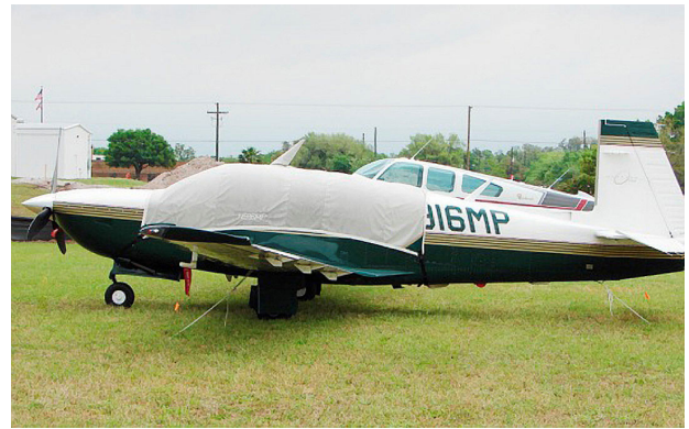
Mooney Ovation Canopy Cover