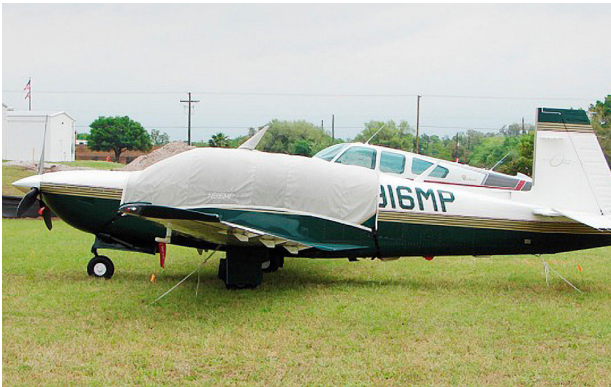
Mooney Ovation Canopy Cover

Travel Covers are made with Silver Solution-Dyed Polyester fabric and only lined over the windshield to save weight. The material is lightweight and more compact for easy stowage in the aircraft. The polyester material is water resistant, but only intended for occasional use outside. We also have an ultra lightweight material available for fitted hangar dust covers. For daily outdoor use, the non-travel Sunbrella Cover is the best choice.