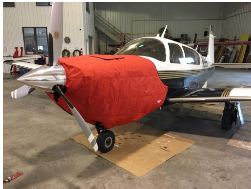
Mooney Ovation Insulated Engine Cover

This cover type is made from Silver Acrylic Sunbrella canvas and is 100% lined with a soft and smooth microfiber. Bruce's Custom Covers developed this material combination especially for aircraft protection. The outer material is medium weight and treated for water resistance, UV resistance and anti-static buildup. The inner lining is a very soft and smooth microfiber to prevent scratching. The material is very reflective, and tests show that the cabin interior temperature can be reduced to near-ambient temperature on the hottest of days. It is water, ice and snow repellent, yet breathable to allow moisture to escape from between the cover and the aircraft surface.