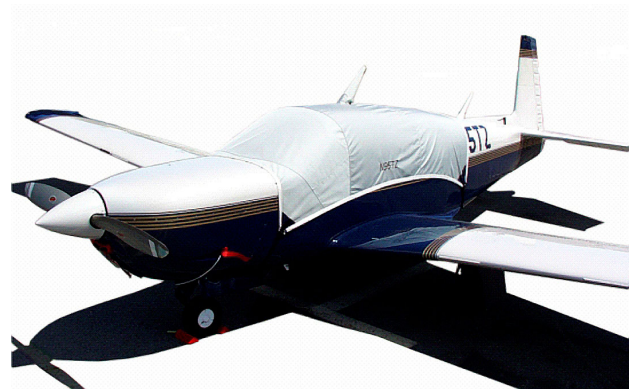
Porsche Mooney Canopy Cover & Plugs