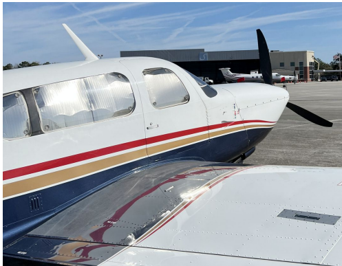
Mooney M20S Heatshield Set

Heatshields are interior sunshades for an aircraft's windows or canopy glass. The product is a unique composite of closed-cell foam with a silver mylar finish. The semi-rigid design is stiff enough to stand along the inside of the windshield using sun visors or window framing. It folds up flat and easily stores in the included storage sleeve. Some designs may require velcro and suction cups. A Heatshield is an excellent short-term remedy for cockpit overheating.