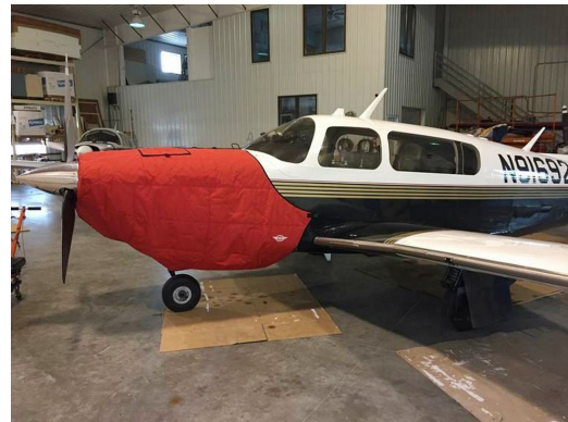
Mooney Ovation Insulated Engine Cover