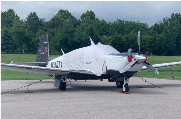
Mooney M20TN Extended Canopy Cover

This cover type is made from Silver Acrylic Sunbrella canvas and is 100% lined with a soft and smooth microfiber. Bruce's Custom Covers developed this material combination especially for aircraft protection. The outer material is medium weight and treated for water resistance, UV resistance and anti-static buildup. The inner lining is a very soft and smooth microfiber to prevent scratching. The material is very reflective, and tests show that the cabin interior temperature can be reduced to near-ambient temperature on the hottest of days. It is water, ice and snow repellent, yet breathable to allow moisture to escape from between the cover and the aircraft surface.