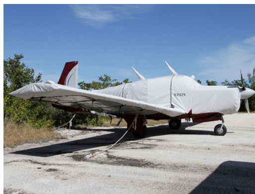
Mooney M20C Extended Canopy/Engine & Wing Covers