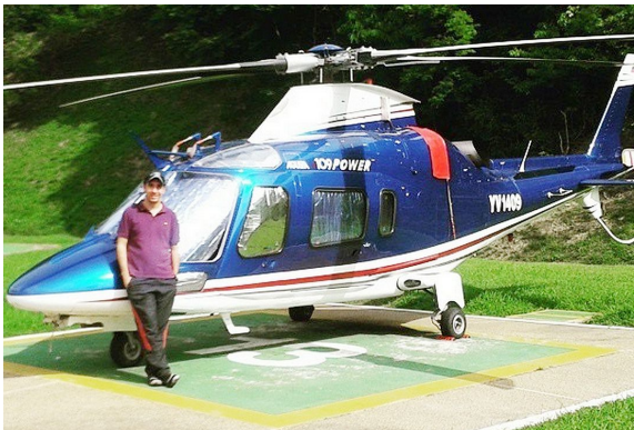
Agusta Power Cockpit & Cabin HeatShields

Heatshields are interior sunshades for an aircraft's windows or canopy glass. The product is a unique composite of closed-cell foam with a silver mylar finish. The semi-rigid design is stiff enough to stand along the inside of the windshield using sun visors or window framing. It folds up flat and easily stores in the included storage sleeve. Some designs may require velcro and suction cups. A Heatshield is an excellent short-term remedy for cockpit overheating.