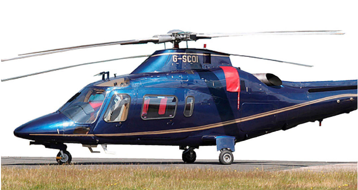
Agusta Power Intake Cover