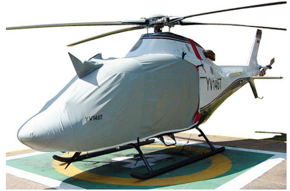
Koala Bubble Cover (with Wire Strike)