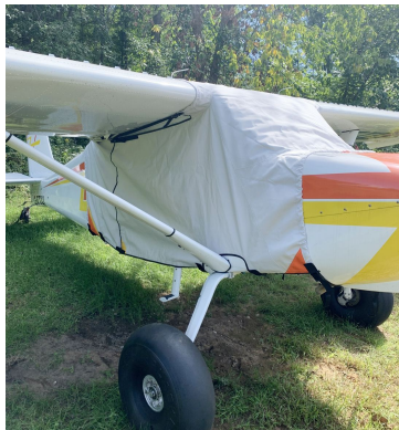
Murphy Elite Over The Top Style Extended Canopy Cover