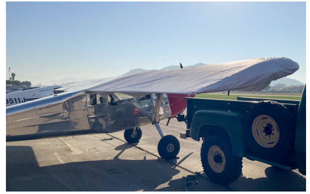
Murphy Elite Wing Covers, test fit cover