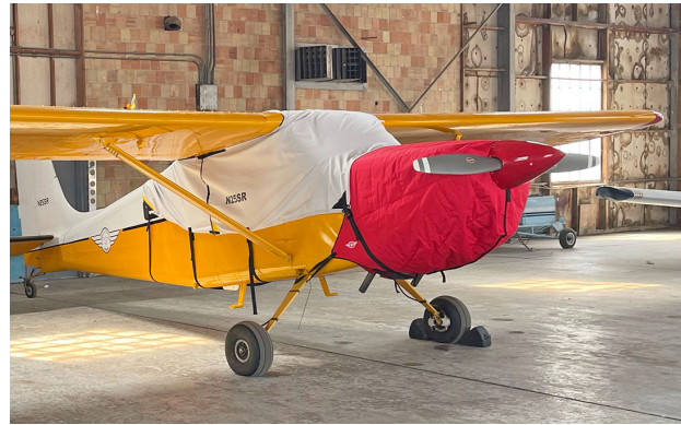
Murphy Super Rebel Insulated Engine Cover