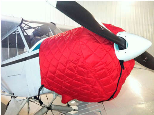
Piper Super Cub Insulated Engine Cover

This cover type is made from Silver Acrylic Sunbrella canvas and is 100% lined with a soft and smooth microfiber. Bruce's Custom Covers developed this material combination especially for aircraft protection. The outer material is medium weight and treated for water resistance, UV resistance and anti-static buildup. The inner lining is a very soft and smooth microfiber to prevent scratching. The material is very reflective, and tests show that the cabin interior temperature can be reduced to near-ambient temperature on the hottest of days. It is water, ice and snow repellent, yet breathable to allow moisture to escape from between the cover and the aircraft surface.