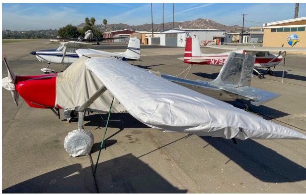
Murphy Elite Wing Covers