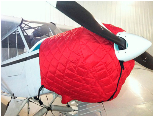
Piper Super Cub Insulated Engine Cover

This cover type is made from Silver Acrylic Sunbrella canvas and is 100% lined with a soft and smooth microfiber. Bruce's Custom Covers developed this material combination especially for aircraft protection. The outer material is medium weight and treated for water resistance, UV resistance and anti-static buildup. The inner lining is a very soft and smooth microfiber to prevent scratching. The material is very reflective, and tests show that the cabin interior temperature can be reduced to near-ambient temperature on the hottest of days. It is water, ice and snow repellent, yet breathable to allow moisture to escape from between the cover and the aircraft surface.