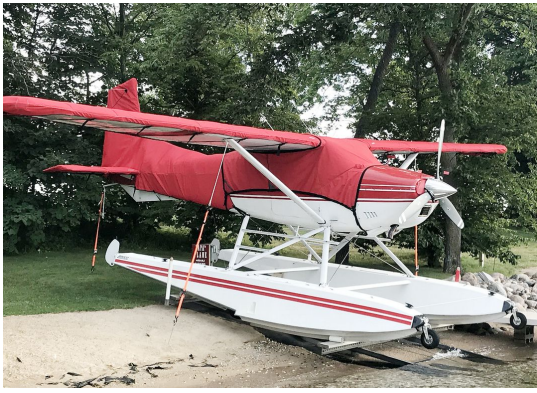
Cessna 185 Canopy, Wings & Empennage Covers, and Engine Plugs