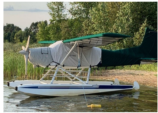
Cessna A185F Complete Cover Set