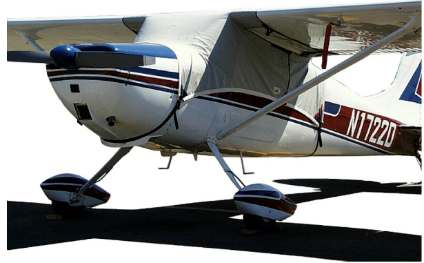
Over-the-Top Canopy Cover