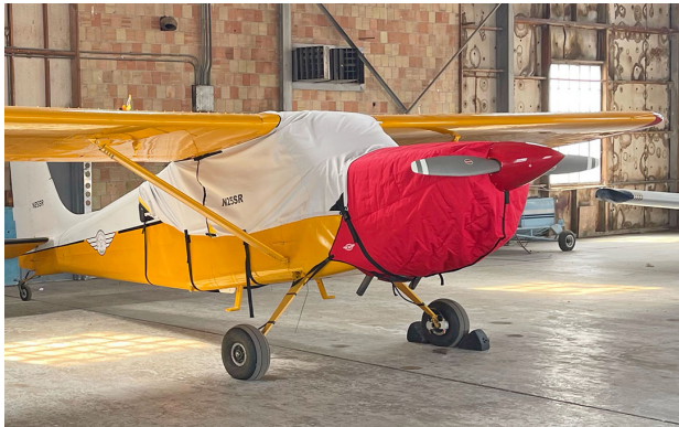
Murphy Super Rebel Insulated Engine Cover