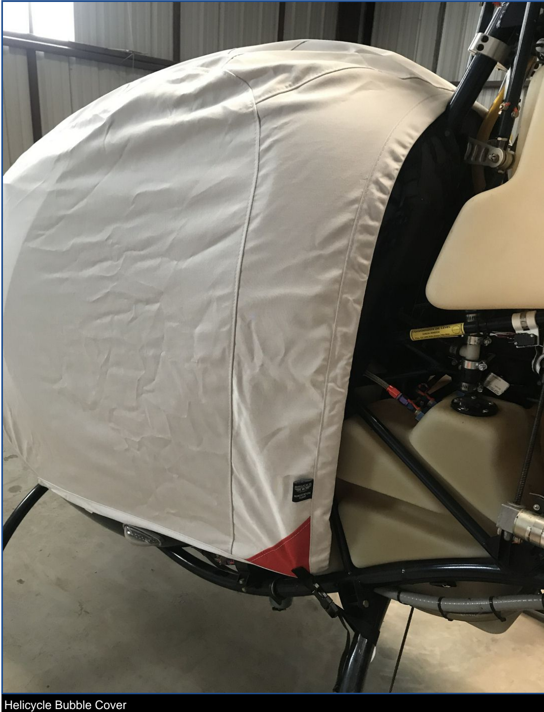
Helicycle Bubble Cover