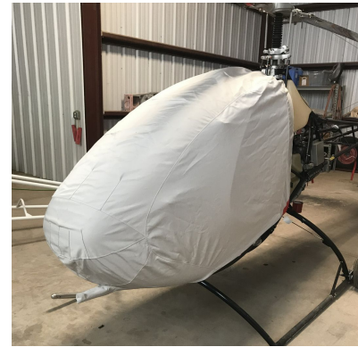
Helicycle Bubble Cover