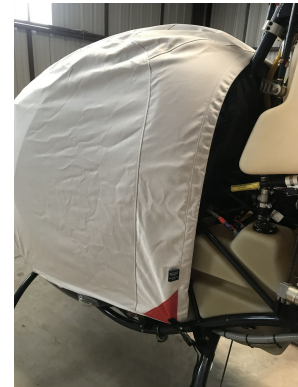
Helicycle Bubble Cover