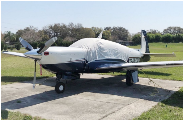
Mooney Ovation Canopy Cover