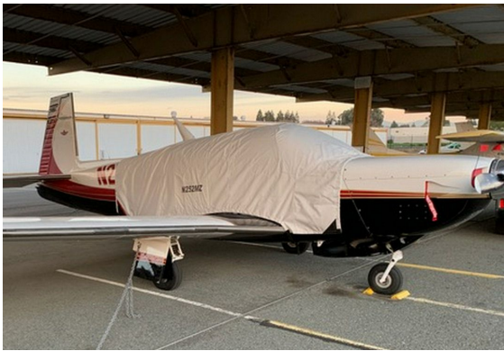
Mooney M20K Extended Canopy Cover

This cover type is made from Silver Acrylic Sunbrella canvas and is 100% lined with a soft and smooth microfiber. Bruce's Custom Covers developed this material combination especially for aircraft protection. The outer material is medium weight and treated for water resistance, UV resistance and anti-static buildup. The inner lining is a very soft and smooth microfiber to prevent scratching. The material is very reflective, and tests show that the cabin interior temperature can be reduced to near-ambient temperature on the hottest of days. It is water, ice and snow repellent, yet breathable to allow moisture to escape from between the cover and the aircraft surface.