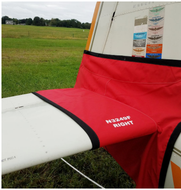
Mooney M20E Tailcone Cover