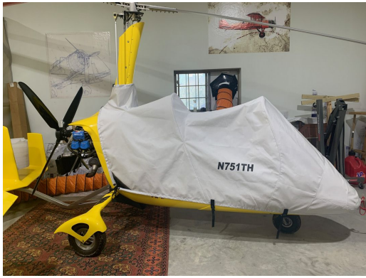
MTO Sport Canopy/Nose Cover