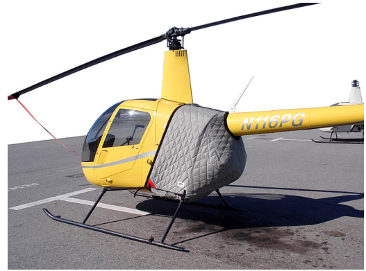
Robinson R-22 Insulated Engine Cover (also covers bottom) & Front Blade Tie-down