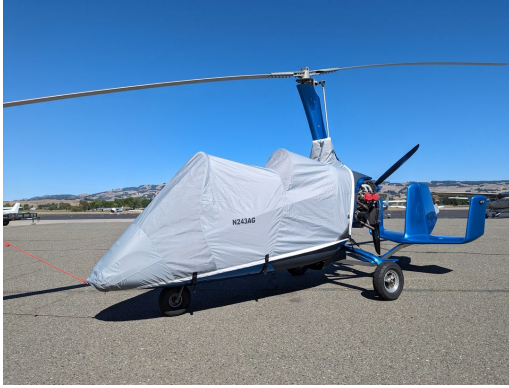
Autogyro MTOSPORT Travel Cover, Light Weight Canopy/Nose Cover

and more compact for easy stowage in the aircraft. The polyester material is water resistant, but only intended for occasional use outside. We also have an ultra lightweight material available for fitted hangar dust covers. For daily outdoor use, the non-travel Sunbrella Cover is the best choice.