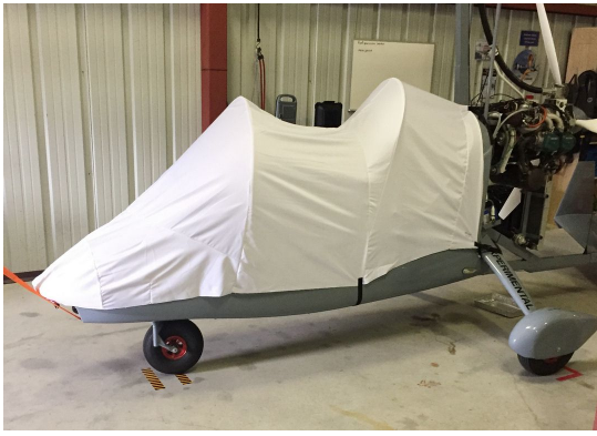
Magni M16 Autogyro Canopy/Nose Cover, test fit cover