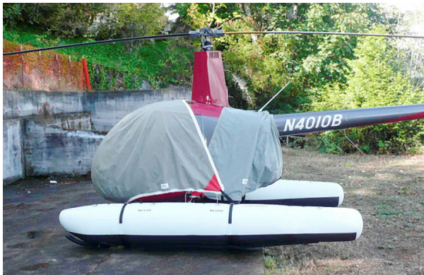
Robinson R-22 Standard Bubble Cover & Engine Cover

Bruce's Autogyro MTO Sport, 2010, 2017 Gyrocopter Blade Covers are made of medium-weight Solution-Dyed Polyester and designed to avoid trim tabs or wicks. You can install Blade Covers from the ground with the aid of a lightweight rope attached to the open end. Covers are cinched tight at the blade root with straps and quick-release plastic buckles. The Cold Weather Blade Covers are fitted with full-length zippers and optional deice "boots" designed to accept a preheater hose; a small opening at the tip of the cover allows for some air circulation and drainage in freezing weather. Some part numbers have features for an extra charge.