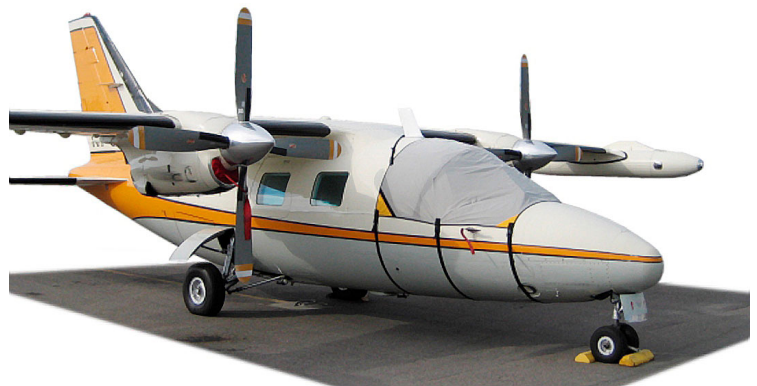
MU-2 Windshield Cover & Engine Plugs