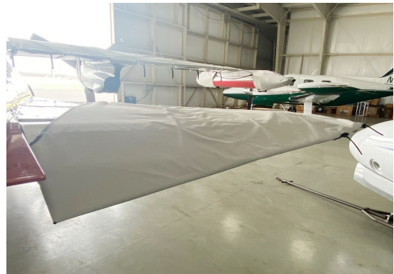
MU-2 Horizontal Stabilizer Covers