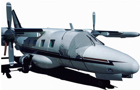
MU-2 Windshield Cover & Engine Plugs

Travel Covers are made with Silver Solution-Dyed Polyester fabric and only lined over the windshield to save weight. The material is lightweight and more compact for easy stowage in the aircraft. The polyester material is water resistant, but only intended for occasional use outside. We also have an ultra lightweight material available for fitted hangar dust covers. For daily outdoor use, the non-travel Sunbrella Cover is the best choice.