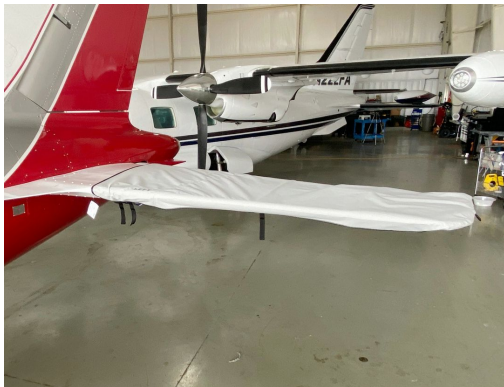
MU-2 Horizontal Stabilizer Covers

WINTER USE MATERIAL - Made with Solution-Dyed Polyester fabric, this option is intended for seasonal use to aid in deicing, rain mitigation, or for occasional travel. The material is lighter and more compact, but more susceptible to UV damage and may have a shorter useful life if used continuously outside than the all-year use material.