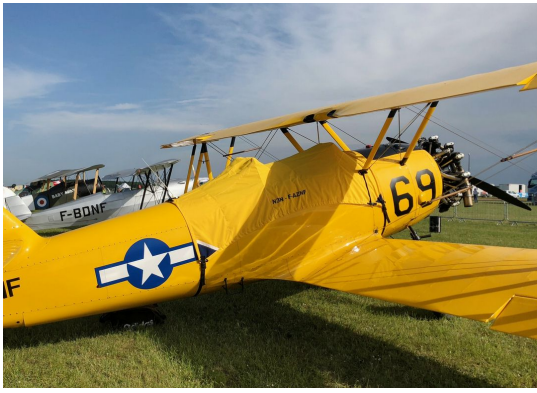
Naval Aircraft Factory N3N Canopy Cover