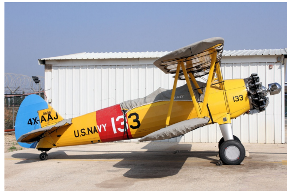
Boeing Stearman PT-13 Canopy, Wing & Horiz. Stab Covers