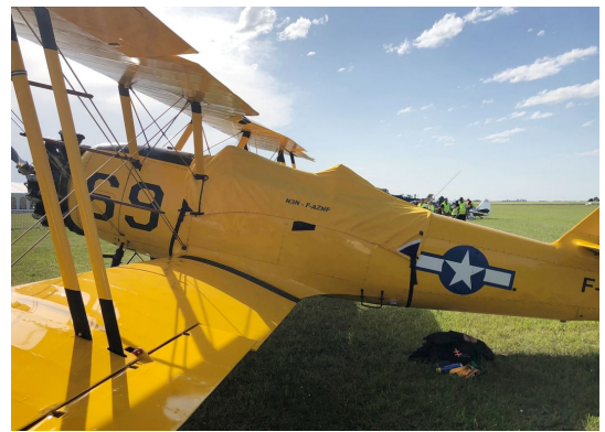
Naval Aircraft Factory N3N Canopy Cover