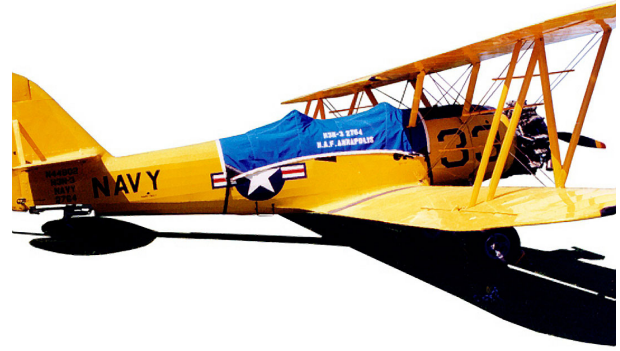
N3N Canopy Cover