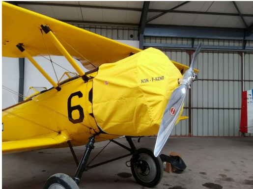
N3N Engine Cover

This cover type is made from Silver Acrylic Sunbrella canvas and is 100% lined with a soft and smooth microfiber. Bruce's Custom Covers developed this material combination especially for aircraft protection. The outer material is medium weight and treated for water resistance, UV resistance and anti-static buildup. The inner lining is a very soft and smooth microfiber to prevent scratching. The material is very reflective, and tests show that the cabin interior temperature can be reduced to near-ambient temperature on the hottest of days. It is water, ice and snow repellent, yet breathable to allow moisture to escape from between the cover and the aircraft surface.