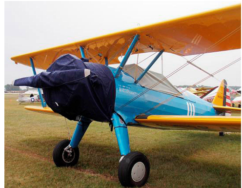
Stearman PT-13 Engine Cover