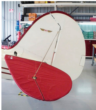
Waco UPF-7 Horizontal Stab. Cover

WINTER USE MATERIAL - Made with Solution-Dyed Polyester fabric, this option is intended for seasonal use to aid in deicing, rain mitigation, or for occasional travel. The material is lighter and more compact, but more susceptible to UV damage and may have a shorter useful life if used continuously outside than the all-year use material.