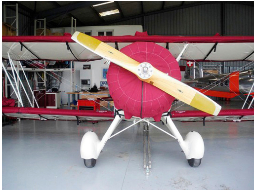
Waco UPF-7 Engine Cover

This cover type is made from Silver Acrylic Sunbrella canvas and is 100% lined with a soft and smooth microfiber. Bruce's Custom Covers developed this material combination especially for aircraft protection. The outer material is medium weight and treated for water resistance, UV resistance and anti-static buildup. The inner lining is a very soft and smooth microfiber to prevent scratching. The material is very reflective, and tests show that the cabin interior temperature can be reduced to near-ambient temperature on the hottest of days. It is water, ice and snow repellent, yet breathable to allow moisture to escape from between the cover and the aircraft surface.