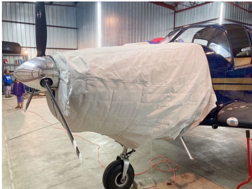
Navion Insulated Engine Cover

This cover type is made from Silver Acrylic Sunbrella canvas and is 100% lined with a soft and smooth microfiber. Bruce's Custom Covers developed this material combination especially for aircraft protection. The outer material is medium weight and treated for water resistance, UV resistance and anti-static buildup. The inner lining is a very soft and smooth microfiber to prevent scratching. The material is very reflective, and tests show that the cabin interior temperature can be reduced to near-ambient temperature on the hottest of days. It is water, ice and snow repellent, yet breathable to allow moisture to escape from between the cover and the aircraft surface.