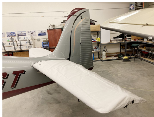
Navion Rangemaster Horizontal Stabilizer Covers