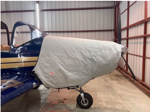
Navion Insulated Engine Cover