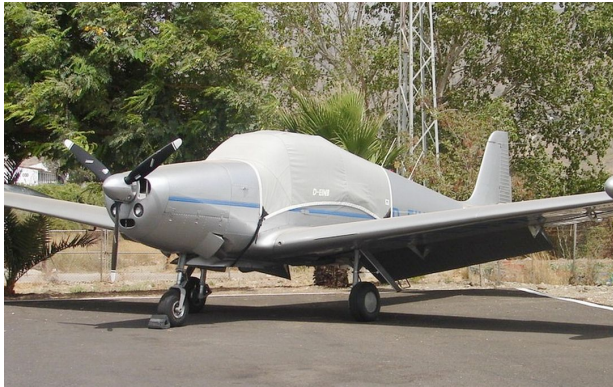
Navion Rangemaster Canopy Cover

This cover type is made from Silver Acrylic Sunbrella canvas and is 100% lined with a soft and smooth microfiber. Bruce's Custom Covers developed this material combination especially for aircraft protection. The outer material is medium weight and treated for water resistance, UV resistance and anti-static buildup. The inner lining is a very soft and smooth microfiber to prevent scratching. The material is very reflective, and tests show that the cabin interior temperature can be reduced to near-ambient temperature on the hottest of days. It is water, ice and snow repellent, yet breathable to allow moisture to escape from between the cover and the aircraft surface.