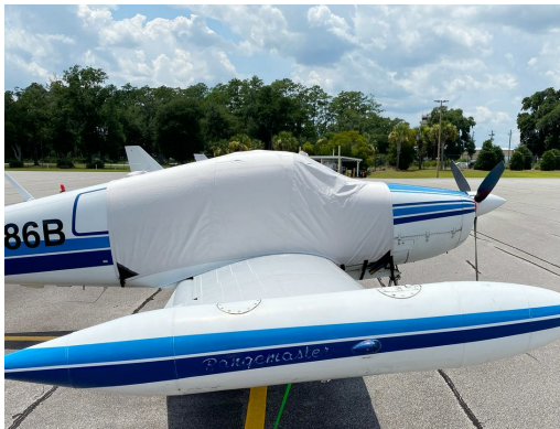
Navion Rangemaster Extended Canopy Cover

This cover type is made from Silver Acrylic Sunbrella canvas and is 100% lined with a soft and smooth microfiber. Bruce's Custom Covers developed this material combination especially for aircraft protection. The outer material is medium weight and treated for water resistance, UV resistance and anti-static buildup. The inner lining is a very soft and smooth microfiber to prevent scratching. The material is very reflective, and tests show that the cabin interior temperature can be reduced to near-ambient temperature on the hottest of days. It is water, ice and snow repellent, yet breathable to allow moisture to escape from between the cover and the aircraft surface.