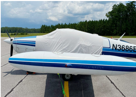
Navion Rangemaster Extended Canopy Cover