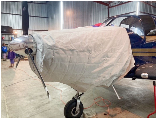
Navion Insulated Engine Cover

This cover type is made from Silver Acrylic Sunbrella canvas and is 100% lined with a soft and smooth microfiber. Bruce's Custom Covers developed this material combination especially for aircraft protection. The outer material is medium weight and treated for water resistance, UV resistance and anti-static buildup. The inner lining is a very soft and smooth microfiber to prevent scratching. The material is very reflective, and tests show that the cabin interior temperature can be reduced to near-ambient temperature on the hottest of days. It is water, ice and snow repellent, yet breathable to allow moisture to escape from between the cover and the aircraft surface.