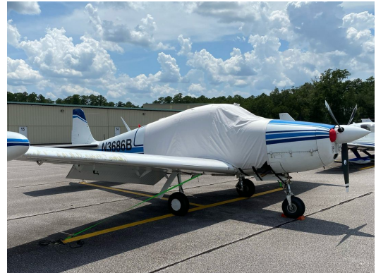
Navion Rangemaster Extended Canopy Cover