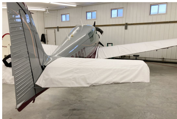
Navion Rangemaster Wing & Horizontal Stabilizer Covers

shorter useful life if used continuously outside than the all-year use material.