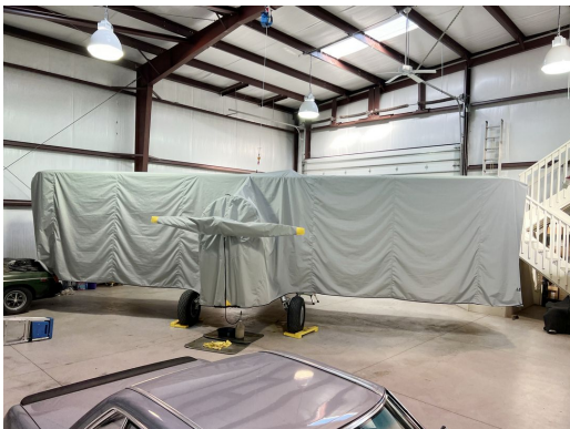
Stearman PT-13 Full Body Dust Cover

Some high value aircraft end up logging lots of hangar time, and become dust magnets in the process. A high quality, well fitting dust cover provides easy assurance that the aircraft's surfaces remain clean and free of grit and grime. Available in a large variety of colors, each dust cover is custom made according to aircraft details and customer preferences. Fire retardant fabrics are also available.