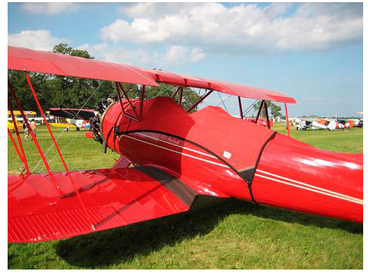
Waco UPF7 Canopy Cover