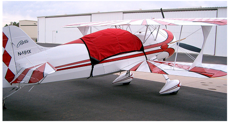
Pitts Model 12 Canopy Cover