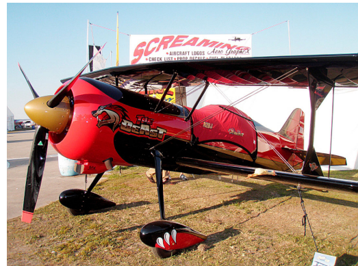
Pitts Model 12 Canopy Cover, single seat