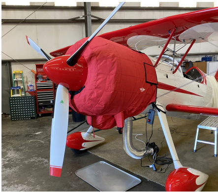
Pitts Model 12 Insulated Engine Cover