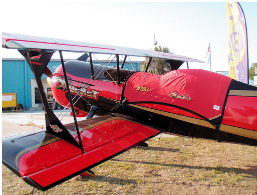
Pitts Model 12 Canopy Cover, single seat

Travel Covers are made with Silver Solution-Dyed Polyester fabric and only lined over the windshield to save weight. The material is lightweight and more compact for easy stowage in the aircraft. The polyester material is water resistant, but only intended for occasional use outside. We also have an ultra lightweight material available for fitted hangar dust covers. For daily outdoor use, the non-travel Sunbrella Cover is the best choice.