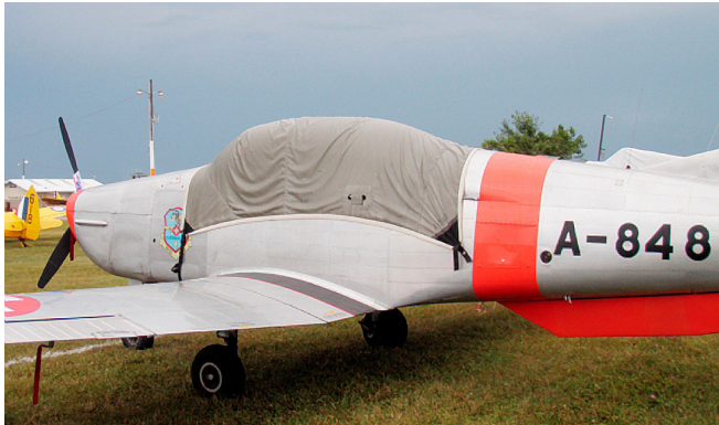
Piaggio P-149D Trainer Canopy Cover

Cover and Engine Cover. This cover will enclose the engine cowl and will extend aft to cover all of the windows. This cover type is made from Silver Acrylic Sunbrella canvas and is 100% lined with a soft and smooth microfiber. Bruce's Custom Covers developed this material combination especially for aircraft protection. The outer material is medium weight and treated for water resistance, UV resistance and anti-static buildup. The inner lining is a very soft and smooth microfiber to prevent scratching. The material is very reflective, and tests show that the cabin interior temperature can be reduced to near-ambient temperature on the hottest of days. It is water, ice and snow repellent, yet breathable to allow moisture to escape from between the cover and the aircraft surface.