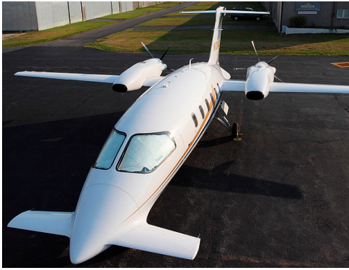
Piaggio 180 Cockpit HeatShields

in the included storage sleeve. Some designs may require velcro and suction cups. A Heatshield is an excellent short-term remedy for cockpit overheating, but an external fabric cover is more effective for long-term protection.