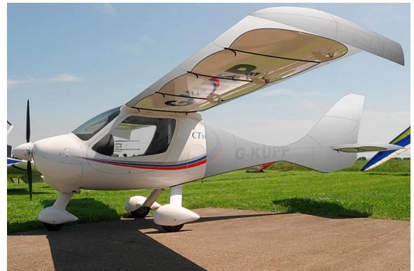
Wing Covers & Empennage Cover (illustration)