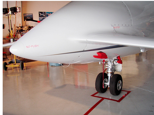
Piaggio 180 Pitot & Rosemount Covers