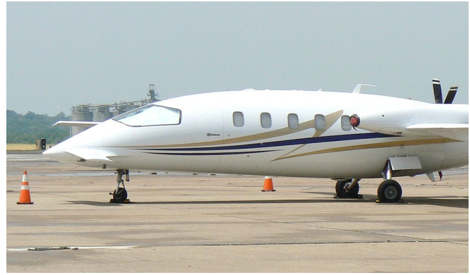
Piaggio Avanti P180 Cockpit Heatshields