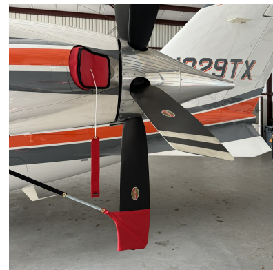
Piaggio P1080 Exhaust Covers & Prop Tie-Downs