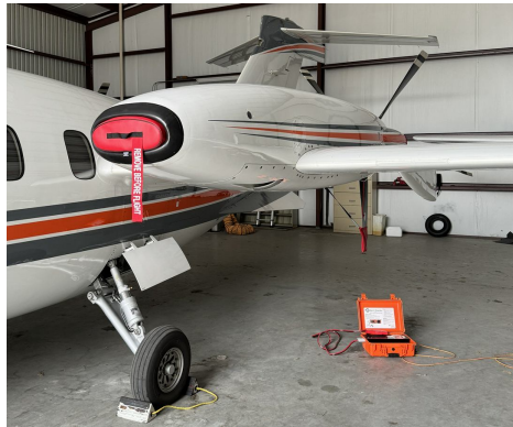
Piaggio P180 Engine Inlet Plugs

Engine Inlet Plugs are custom fit for your Piaggio Avanti P180 intakes, made with heavy-duty vinyl material, and stuffed with a single block of sculpted urethane foam. Each plug has a zipper that allows the foam to be removed and dried if necessary. Engine plugs have warning flags that are visible from the cockpit or 'remove before flight' streamers sewn onto the face of the plugs. Most plugs are imprinted with the aircraft registration number in black for an extra charge. Storage bag NOT included. Engine plugs may be inserted after flight when the engine is still warm. Engine Inlet Plugs are commonly referred to as Cowl Plugs, Intake Plugs, Cowl Blocks, Engine Blocks, and Engine Bung.