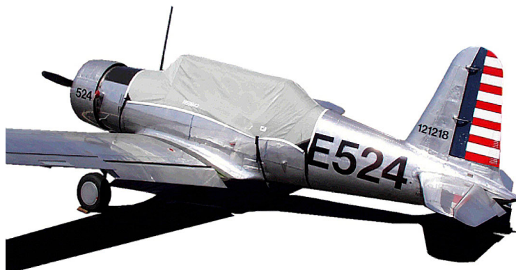
BT-13 Canopy Cover