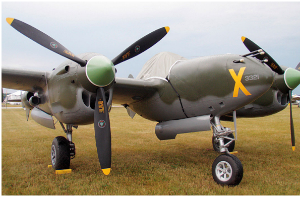
P38 Lightning Canopy Cover (snap-on type)