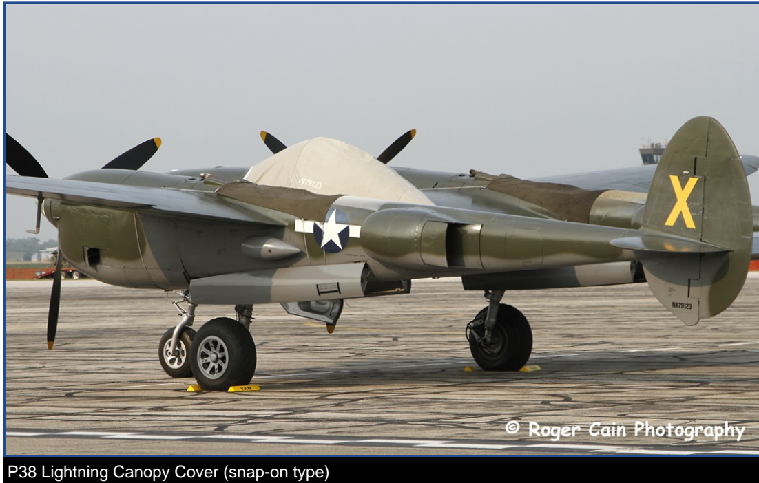
P38 Lightning Canopy Cover (snap-on type)