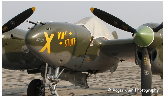
P38 Lightning Canopy Cover (snap-on type)