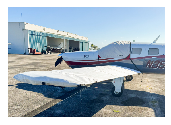
Piper PA 46-350P Cockpit & Wing Covers