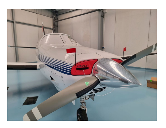
Piper PA-46 Malibu Engine Inlet Plugs