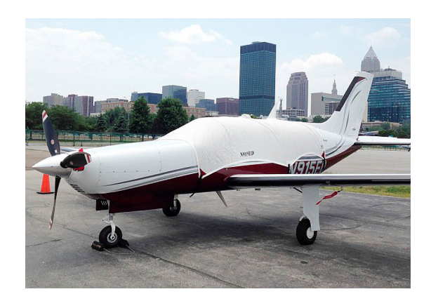
Piper Mirage Canopy Cover, Engine Plugs

This cover type is made from Silver Acrylic Sunbrella canvas and is 100% lined with a soft and smooth microfiber. Bruce's Custom Covers developed this material combination especially for aircraft protection. The outer material is medium weight and treated for water resistance, UV resistance and anti-static buildup. The inner lining is a very soft and smooth microfiber to prevent scratching. The material is very reflective, and tests show that the cabin interior temperature can be reduced to near-ambient temperature on the hottest of days. It is water, ice and snow repellent, yet breathable to allow moisture to escape from between the cover and the aircraft surface.