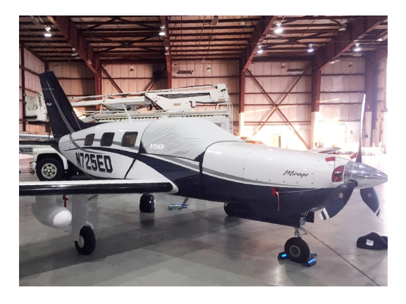
Piper Malibu/Mirage Cockpit Cover, Engine Plugs