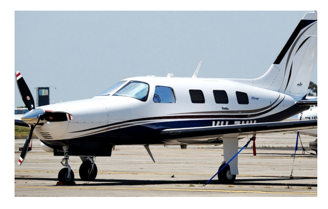
Piper PA-46-350P Mirage, Matrix, JetProp Cockpit Heatshields