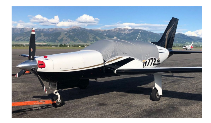
Piper PA46-350P Travel Canopy Cover, Engine Plugs

Engine Inlet Plugs are custom fit for your Piper PA-46-350P Mirage, Matrix, JetProp intakes, made with heavy-duty vinyl material, and stuffed with a single block of sculpted urethane foam. Each plug has a zipper that allows the foam to be removed and dried if necessary. Engine plugs have warning flags that are visible from the cockpit or 'remove before flight' streamers sewn onto the face of the plugs. Most plugs are imprinted with the aircraft registration number in black for an extra charge. Storage bag NOT included. Engine plugs may be inserted after flight when the engine is still warm. Engine Inlet Plugs are commonly referred to as Cowl Plugs, Intake Plugs, Cowl Blocks, Engine Blocks, and Engine Bungs.