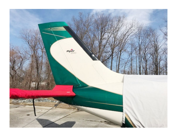
Piper Malibu/Mirage Horizontal Stabilizer/Tailcone Cover