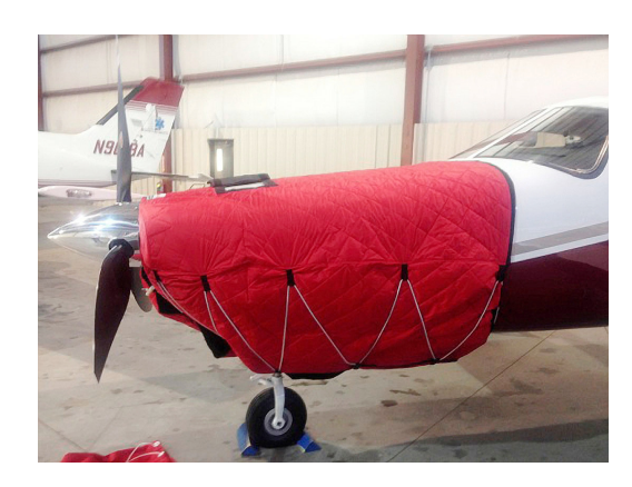
Piper PA-46 Insulated Engine Cover, fully enclosed with oil door flap