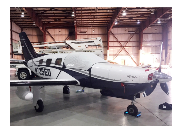
Piper Malibu/Mirage Cockpit Cover, Engine Plugs