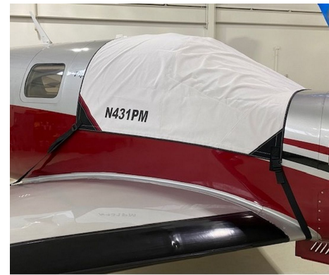
Piper Meridian Cockpit Cover