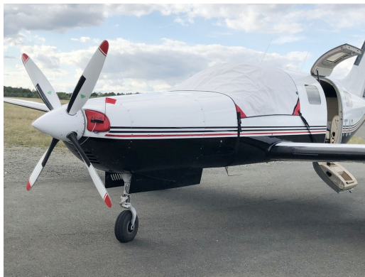
Piper PA-46-50P Malibu Mirage Cockpit Cover

Engine Inlet Plugs are custom fit for your Piper PA-46-500TP, 600TP Meridian, M500, M600, M700 intakes, made with heavy-duty vinyl material, and stuffed with a single block of sculpted urethane foam. Each plug has a zipper that allows the foam to be removed and dried if necessary. Engine plugs have warning flags that are visible from the cockpit or 'remove before flight' streamers sewn onto the face of the plugs. Most plugs are imprinted with the aircraft registration number in black for an extra charge. Storage bag NOT included. Engine plugs may be inserted after flight when the engine is still warm. Engine Inlet Plugs are commonly referred to as Cowl Plugs, Intake Plugs, Cowl Blocks, Engine Blocks, and Engine Bungs.