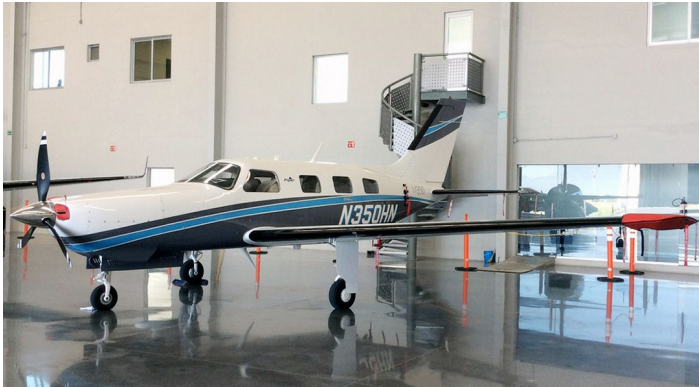
Piper PA-46 Malibu Wingtip Pads

Designed to prevent damage to the aircraft extremities in crowded hangars, these products are made of bright red Naugahyde and thickly padded with a sandwich of closed cell foam.