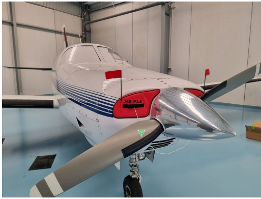
Piper PA-46 Malibu Engine Inlet Plugs