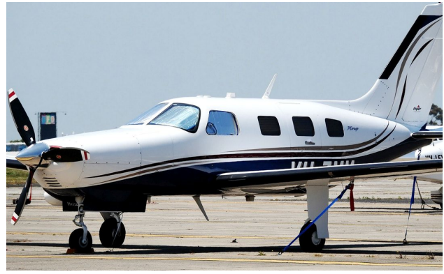
Piper PA-46-350P Mirage, Matrix, JetProp Cockpit Heatshields