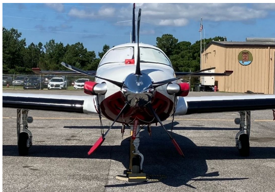
PA-46-600TP Engine Inlet Plugs (Includes Cowl Top Plug)

Engine Inlet Plugs are custom fit for your Piper PA-46-500TP, 600TP Meridian, M500, M600, M700 intakes, made with heavy-duty vinyl material, and stuffed with a single block of sculpted urethane foam. Each plug has a zipper that allows the foam to be removed and dried if necessary. Engine plugs have warning flags that are visible from the cockpit or 'remove before flight' streamers sewn onto the face of the plugs. Most plugs are imprinted with the aircraft registration number in black for an extra charge. Storage bag NOT included. Engine plugs may be inserted after flight when the engine is still warm. Engine Inlet Plugs are commonly referred to as Cowl Plugs, Intake Plugs, Cowl Blocks, Engine Blocks, and Engine Bungs.