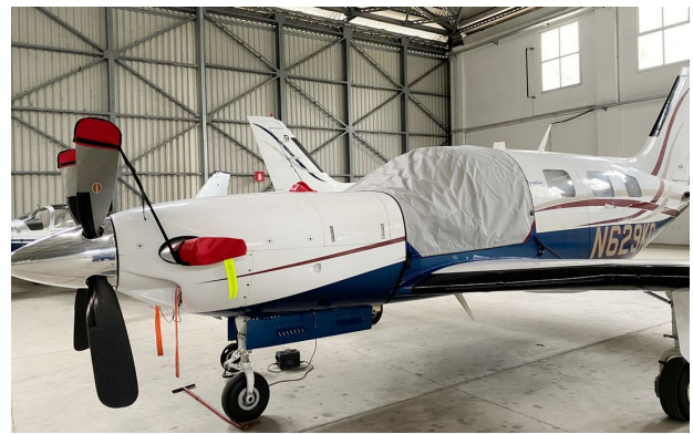
Piper PA-46-500TP Engine Cowling Top Plug