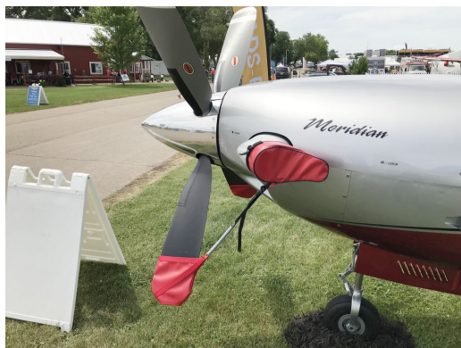
Piper Meridian Prop Tie/Exhaust Covers

This cover type is made from Silver Acrylic Sunbrella canvas and is 100% lined with a soft and smooth microfiber. Bruce's Custom Covers developed this material combination especially for aircraft protection. The outer material is medium weight and treated for water resistance, UV resistance and anti-static buildup. The inner lining is a very soft and smooth microfiber to prevent scratching. The material is very reflective, and tests show that the cabin interior temperature can be reduced to near-ambient temperature on the hottest of days. It is water, ice and snow repellent, yet breathable to allow moisture to escape from between the cover and the aircraft surface.