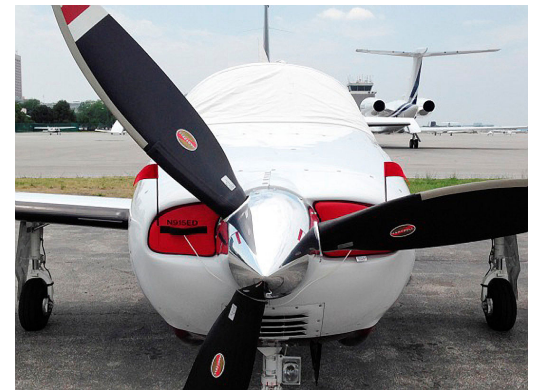
Piper Mirage Engine Plugs