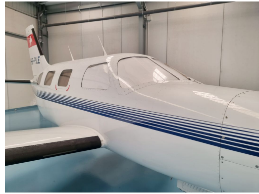
Piper PA-46 Malibu Cockpit Heatshields