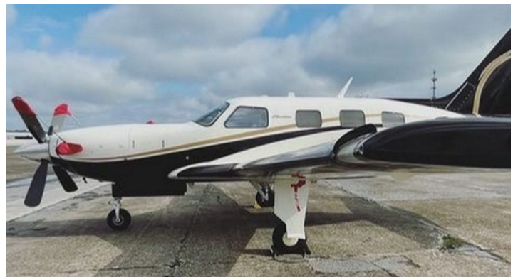
Piper PA-46-500TP prop tie/exhaust cover set