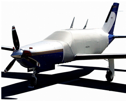
Piper Malibu/Mirage Extended Canopy Cover, Engine, Prop & Wing Covers Piper Malibu/Mirage/Meridian Extended Canopy Cover