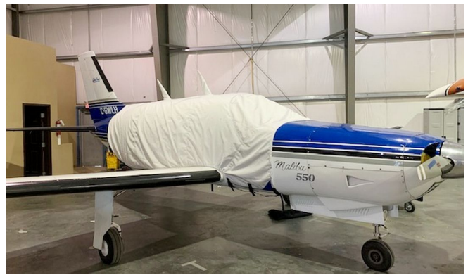
Piper Malibu/Mirage Extended Canopy Cover