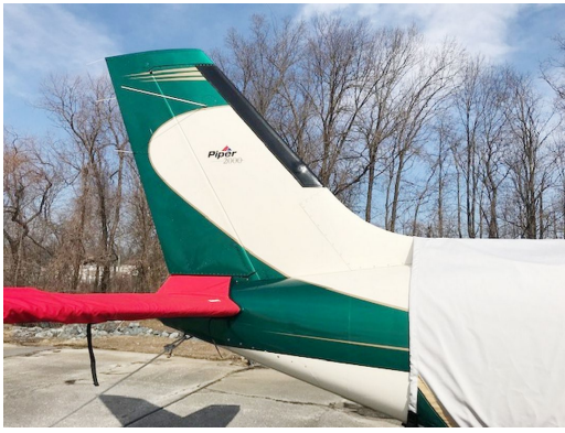
Piper Malibu/Mirage Horizontal Stabilizer/Tailcone Cover