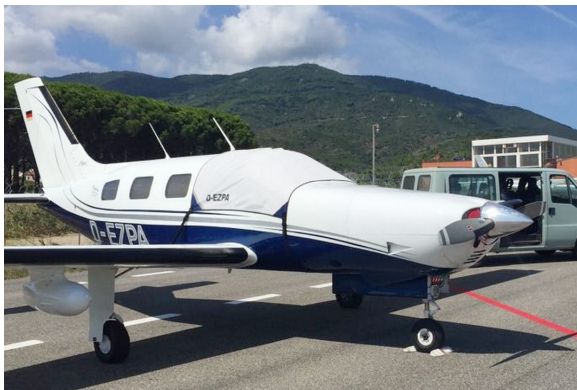
Piper Mirage PA-46-350P Cockpit Cover

This cover type is made from Silver Acrylic Sunbrella canvas and is 100% lined with a soft and smooth microfiber. Bruce's Custom Covers developed this material combination especially for aircraft protection. The outer material is medium weight and treated for water resistance, UV resistance and anti-static buildup. The inner lining is a very soft and smooth microfiber to prevent scratching. The material is very reflective, and tests show that the cabin interior temperature can be reduced to near-ambient temperature on the hottest of days. It is water, ice and snow repellent, yet breathable to allow moisture to escape from between the cover and the aircraft surface.