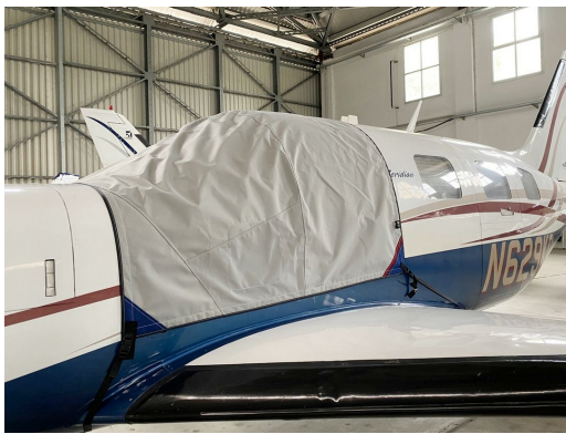
Piper PA-46-500TP Travel Cover Cockpit Cover