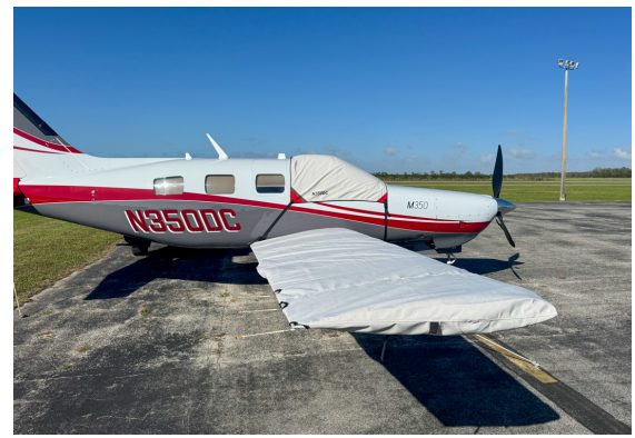
Piper PA 46-350P Cockpit & Wing Covers