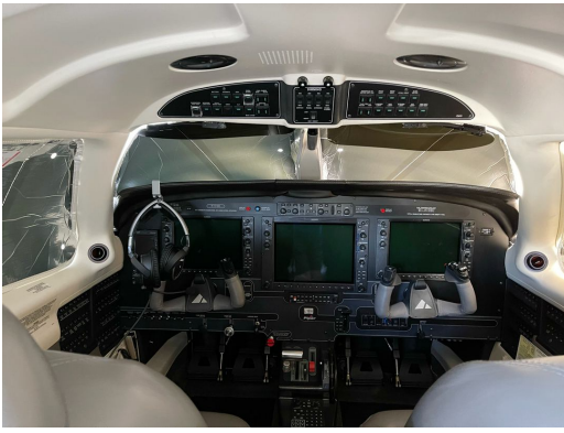
Piper PA46-500TP Cockpit Heatshields