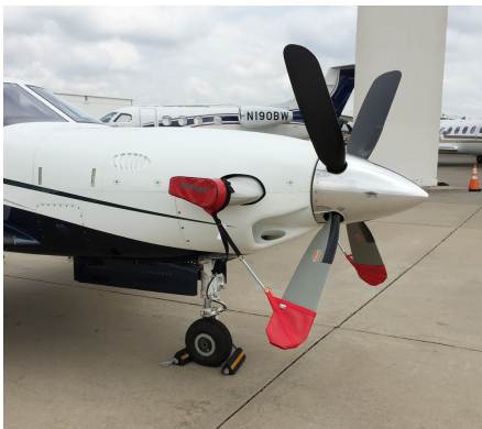
Piper Meridian Prop Tie/Exhaust Cover Set

This cover type is made from Silver Acrylic Sunbrella canvas and is 100% lined with a soft and smooth microfiber. Bruce's Custom Covers developed this material combination especially for aircraft protection. The outer material is medium weight and treated for water resistance, UV resistance and anti-static buildup. The inner lining is a very soft and smooth microfiber to prevent scratching. The material is very reflective, and tests show that the cabin interior temperature can be reduced to near-ambient temperature on the hottest of days. It is water, ice and snow repellent, yet breathable to allow moisture to escape from between the cover and the aircraft surface.