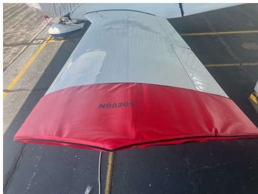
Piper PA-28-140 Wingtip Pads

Designed to prevent damage to the aircraft extremities in crowded hangars, these products are made of bright red Naugahyde and thickly padded with a sandwich of closed cell foam.