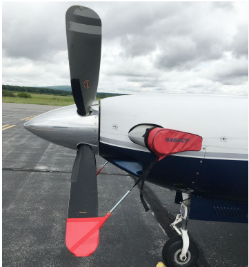
Piper Meridian Prop Tie/Exhaust Covers