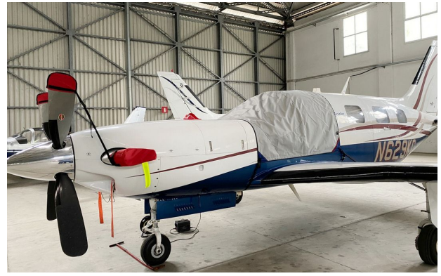
Piper PA-46-500TP Engine Cowling Top Plug