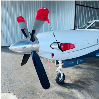
Piper Meridian Prop Tie/Exhaust Cover Set, 4-Blade, Heat Resistant Type

This cover type is made from Silver Acrylic Sunbrella canvas and is 100% lined with a soft and smooth microfiber. Bruce's Custom Covers developed this material combination especially for aircraft protection. The outer material is medium weight and treated for water resistance, UV resistance and anti-static buildup. The inner lining is a very soft and smooth microfiber to prevent scratching. The material is very reflective, and tests show that the cabin interior temperature can be reduced to near-ambient temperature on the hottest of days. It is water, ice and snow repellent, yet breathable to allow moisture to escape from between the cover and the aircraft surface.