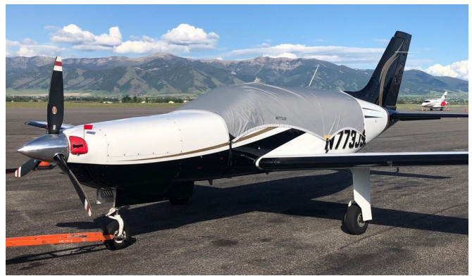
Piper PA46-350P Travel Canopy Cover, Engine Plugs