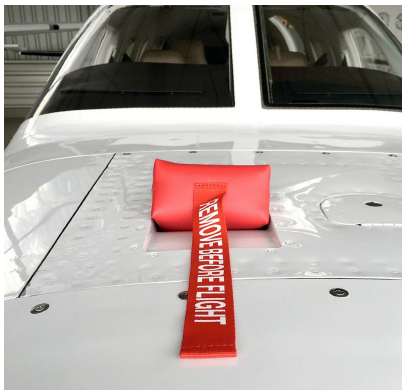
Piper PA-46-500TP Engine Cowl Top Plug (Generator Intake)

Engine Inlet Plugs are custom fit for your Piper PA-46-500TP, 600TP Meridian, M500, M600, M700 intakes, made with heavy-duty vinyl material, and stuffed with a single block of sculpted urethane foam. Each plug has a zipper that allows the foam to be removed and dried if necessary. Engine plugs have warning flags that are visible from the cockpit or 'remove before flight' streamers sewn onto the face of the plugs. Most plugs are imprinted with the aircraft registration number in black for an extra charge. Storage bag NOT included. Engine plugs may be inserted after flight when the engine is still warm. Engine Inlet Plugs are commonly referred to as Cowl Plugs, Intake Plugs, Cowl Blocks, Engine Blocks, and Engine Bungs.