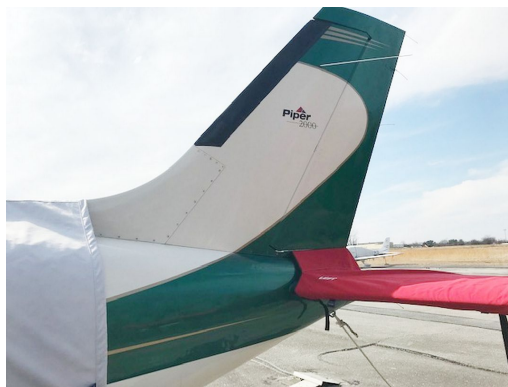
Piper Malibu/Mirage Horizontal Stabilizer/Tailcone Cover