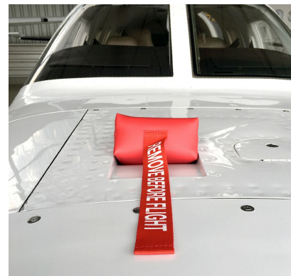
Piper PA-46-500TP Engine Cowl Top Plug (Generator Intake)