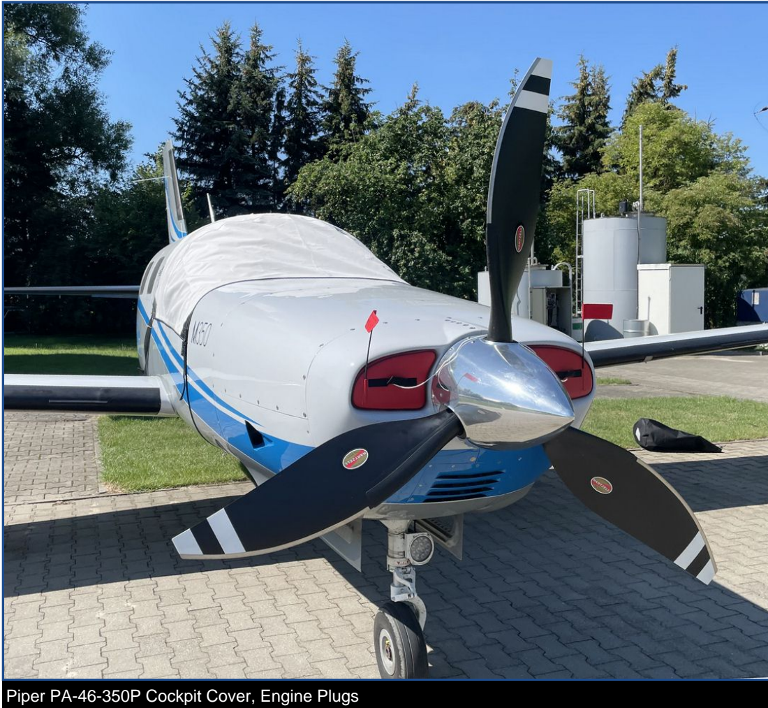
Piper PA-46-350P Cockpit Cover, Engine Plugs