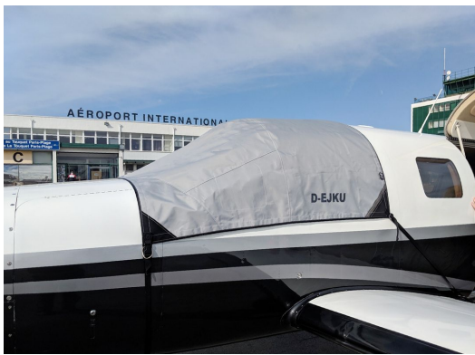
Piper PA46-350P Malibu Mirage Travel Cockpit Cover