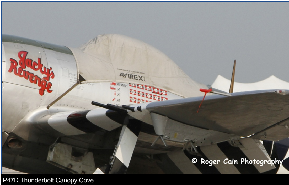
P47D Thunderbolt Canopy Cove