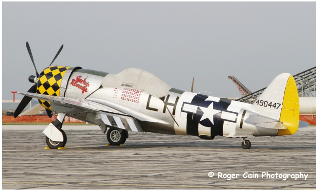
P47D Thunderbolt Canopy Cove