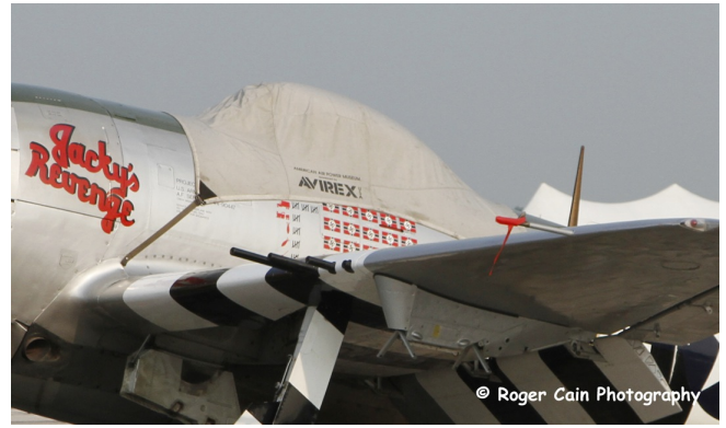
P47D Thunderbolt Canopy Cove