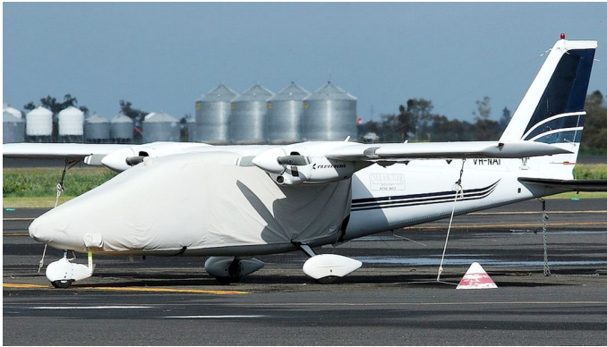
Partenavia P-68C Canopy Cover