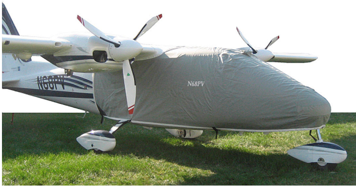
Partenavia Observer Canopy/Bubble Cover

The material is very reflective, and tests show that the cabin interior temperature can be reduced to near-ambient temperature on the hottest of days. It is water, ice and snow repellent, yet breathable to allow moisture to escape from between the cover and the aircraft surface.