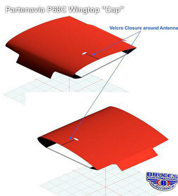
Partenavia Wing "Cap"