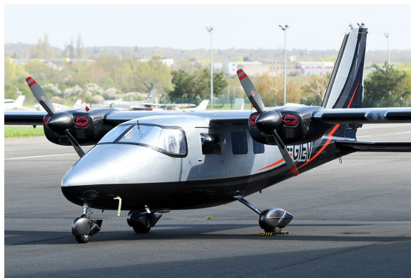
Partenavia P68c Cockpit HeatShields, Engine Plugs

Engine Inlet Plugs are custom fit for your Partenavia, Vulcanair P-68B intakes, made with heavy-duty vinyl material, and stuffed with a single block of sculpted urethane foam. Each plug has a zipper that allows the foam to be removed and dried if necessary. Engine plugs have warning flags that are visible from the cockpit or 'remove before flight' streamers sewn onto the face of the plugs. Most plugs are imprinted with the aircraft registration number in black for an extra charge. Storage bag NOT included. Engine plugs may be inserted after flight when the engine is still warm. Engine Inlet Plugs are commonly referred to as Cowl Plugs, Intake Plugs, Cowl Blocks, Engine Blocks, and Engine Bungs.